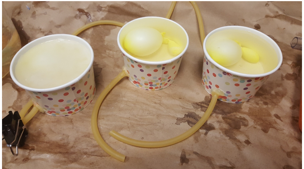
FIGURE 1: Peritonsillar abscess phantom