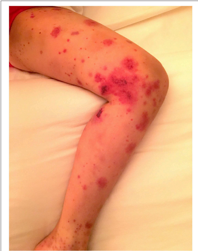
FIGURE 2 | IgA vasculitis presenting in a child illustrating areas of petechiae, purpura, bruising, and necrotic lesions on the limb (parental consent obtained).