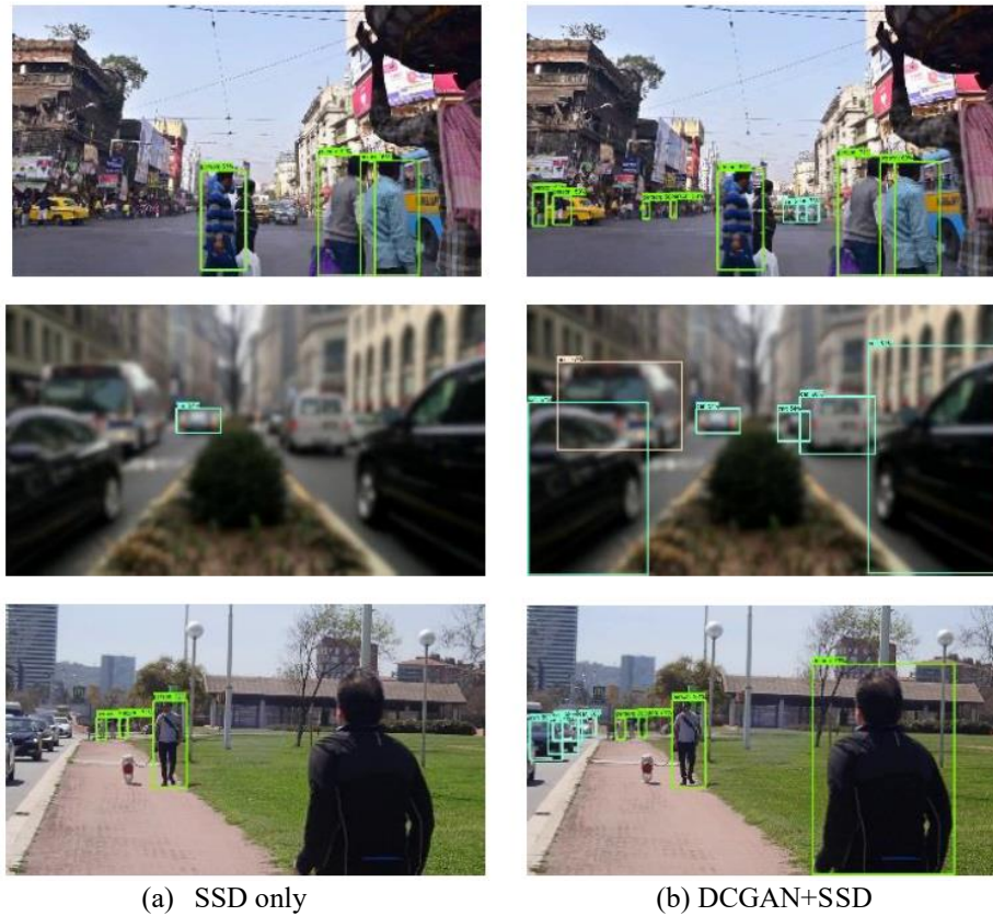
Fig.3. Detection examples for comparison. a) Results with SSD only; b) Results with DCGAN+SSD.

In the convolutional detector, each feature layer is able to produce a fixed set of predictions for detection using convolutional filters as shown at top of the SSD architecture of Figure.2. The SSD is associated with a set of bounding boxes having default sizes relating to each cell from each feature map. The default size of bounding boxes is extracted in a convolutional manner with the feature map, so that the position of each bounding box is related to its sizes in the cell, and the class indicate the presence of feature cell in the bounding boxes.