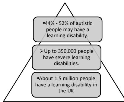
Figure 1: Number of people with learning disabilities in the UK (NHS, 2018)

disabled students (Limbach-Reich & Powell, 2016). Supporting young students who require special educational needs in pursuing higher education is an ambitious and necessary step that needs to be adopted by tertiary education providers worldwide. Figure 1 shows the number of people in the UK with a learning disability.