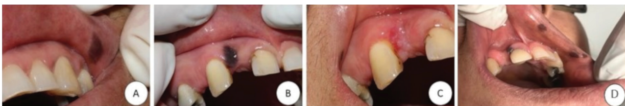
Fig. 1: Clinical aspect of OMA. A) Brownish macula with precise limits localized in the upper lip region on the right side. B) Presence of blackish macula in the maxillary anterior region. C) Brownish macula of smaller size, localized in the upper lip region on the left side. D) Final clinical aspect of OMA after 28 months of follow-up of patient. Three brownish macula localized in the upper lip on the left side, and presence of other blackish macula in the gingiva anterior region.

OMA is a rapid growing lesion occurring mainly in black individuals, and in the majority of cases, in women (2.1:1), with a mean age of 28 years (2,5,6). Thus, differing from the case here related, in which the patient was white. Brooks et al. (7) emphasized that only 10% of cases of OMA were observed in white individuals. In decreasing order, this lesion affects the jugal, labial, palatal and alveolar mucosas. In the present case, gingiva and upper lip were affected, bilaterally. According to Tapia et al. (6), gingiva is outstanding as an atypical site for OMA. According to a previous study by Brooks et al. (7), only 18.9% of the patients with OMA present multiple lesions. Thus, they show evidence of peculiar clinical characteristics of the case here related. In order to review of the literature, it was made a table with a summary of prior reported cases of OMA (Table 1), published until 10th January 2019. With respect to cuta-