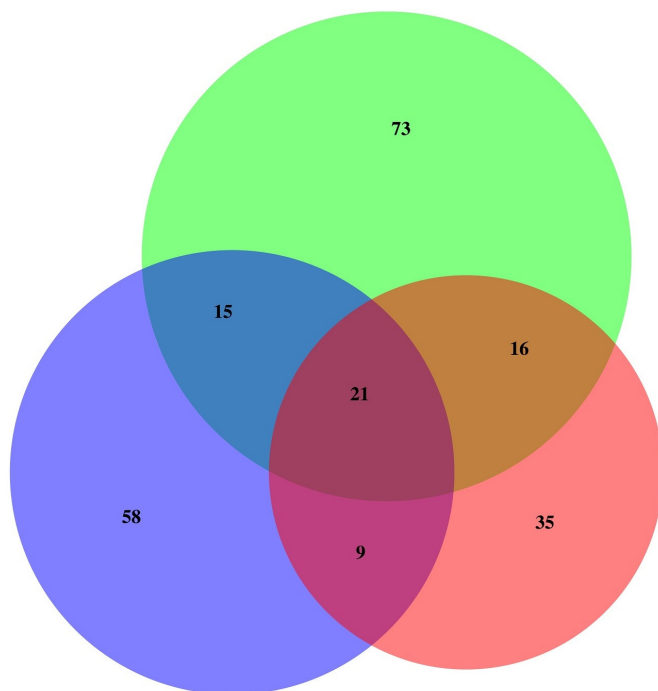
Figure 3 Difference in release date (in months, relative to Canada) of UK and US medication safety letters.

There were differences between jurisdictions in what additional information was provided. Health Canada medication safety letters almost always included the author of the letter as well as the manufacturer, whereas these elements were rarely included in FDA letters and were consistently absent in MHRA letters. The FDA medication safety letters almost always included the scientific justification behind the letter (eg, a reference to a clinical trial or published research), the quantitative data about the adverse effects associated with the medication and links to additional information. These elements were included in less than 50% of the Health Canada and MHRA letters. The MHRA medication safety letters almost always included an introductory paragraph, whereas this was only found in two-thirds of Health Canada and less than a quarter of FDA letters. The MHRA and Health Canada medication safety letters also consistently included clear conclusions in the form of a summary paragraph or bullets, whereas the FDA letters included a clear conclusion in less than 20% of medication safety letters. Last, although present in a minority of letters, the MHRA medication safety letters were more likely than both Health Canada and FDA medication safety letters to include dosing information about the drug in question, and were more likely than Health Canada letters to describe the medication’s effectiveness in treating the indicated condition.