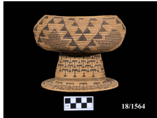
Pedestal baskets: Acc. No. 18/1577 (left) and Acc. No. 18/1564 (right).