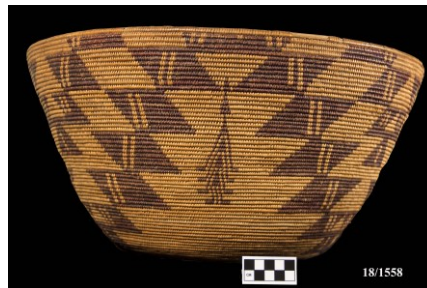
Cooking basket (Acc. No. 18/1558) with “block” and “free-floating” designs.

Design changes were also influenced by Indian beadwork. The best example is a large bowl (Acc. No. 18/1558), Yuki or Maidu in origin that combines traditional “block” designs and innovative “free-floating” designs that resemble small chandeliers. The block design is made of stacks of overlapping parallelograms, and free-floating designs appear in the empty space between the blocks. This innovation in design has been traced to beadwork from Eastern Woodlands Indians involved in the fur trade. In turn, beadwork designs may have had their origin in Canada, Eastern United States and Europe. 13