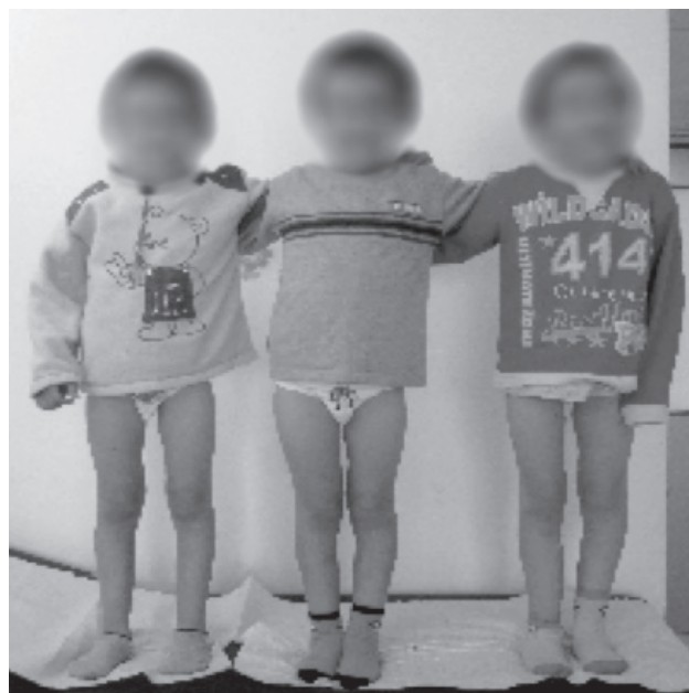
Figure 1 B.