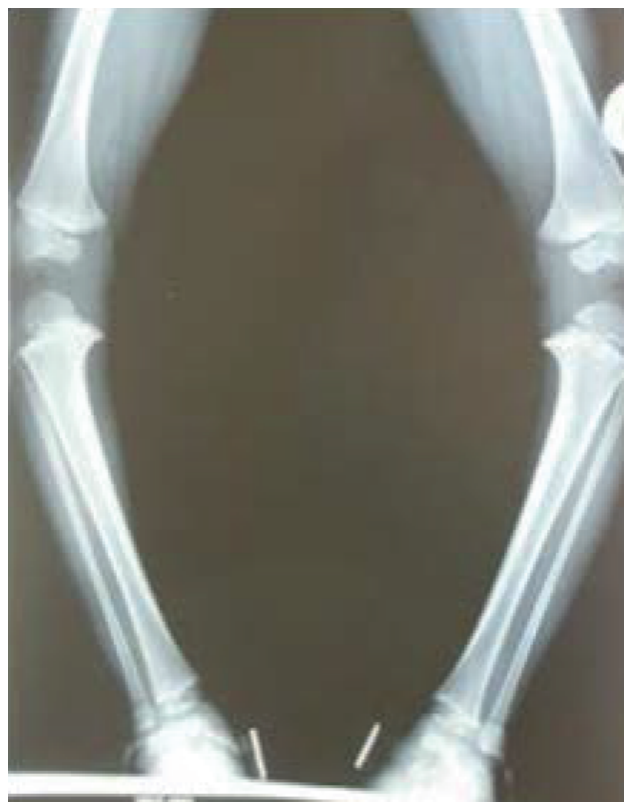
Figure 1 D.

tract infections. Pinkowski and Weiner 19 also reported 11% complications in 37 cases of proximal tibia osteotomies, which included 1 delayed union and 3 superficial infections, without any neurovascular