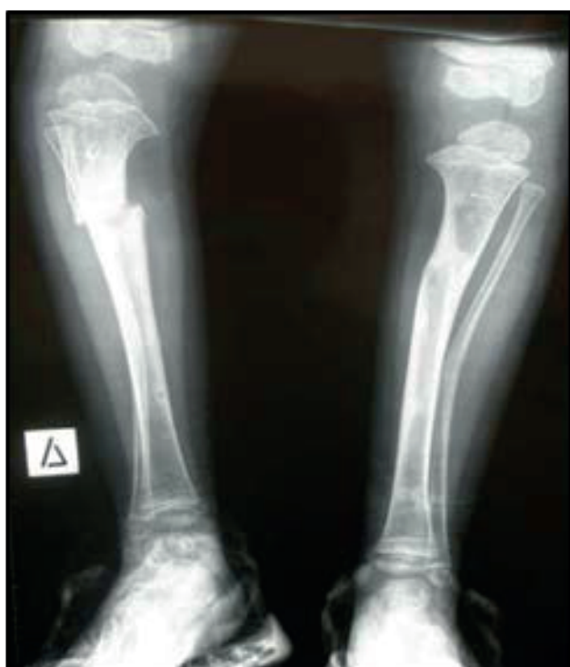
Figure 1 F.