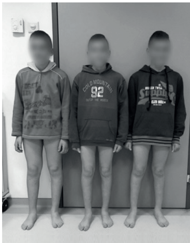
Figure 1 C.