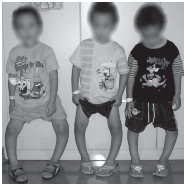
Figure 1 A.