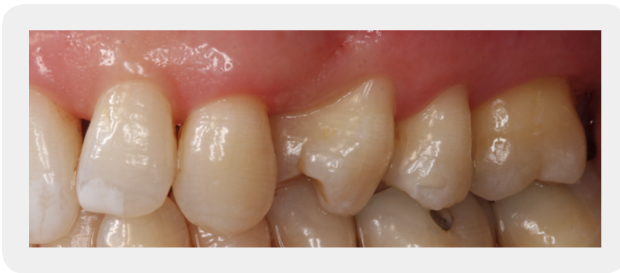
Figure 3b: Pictures after treatment with spermidine. The gingiva appears healed. The opening of the interdental spaces may indicate the resolution of the edema.