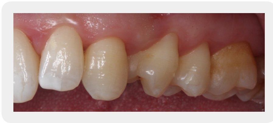
Figure 3a: Pictures before treatment with spermidine. The gingival inflammation due to plaque and calculus is evident