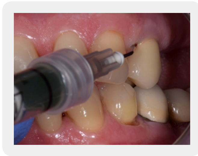
Figure 1: Local delivery of spermidine gel into the periodontal pocket.