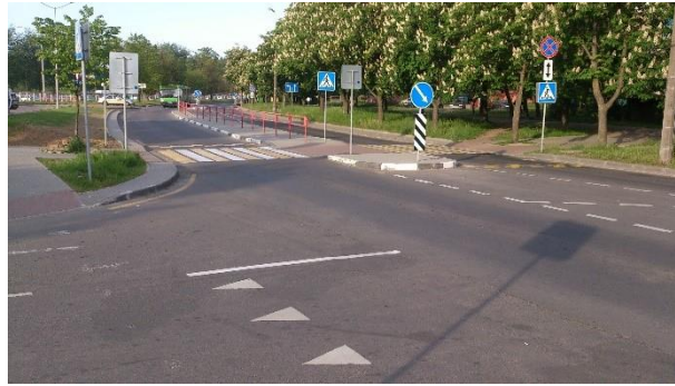
Figure 2. The typical example of the street-refuge's installation in Minsk, Belarus.