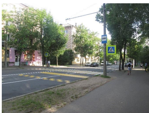
Figure 1. The typical example of the hump’s installation in Minsk, Belarus.