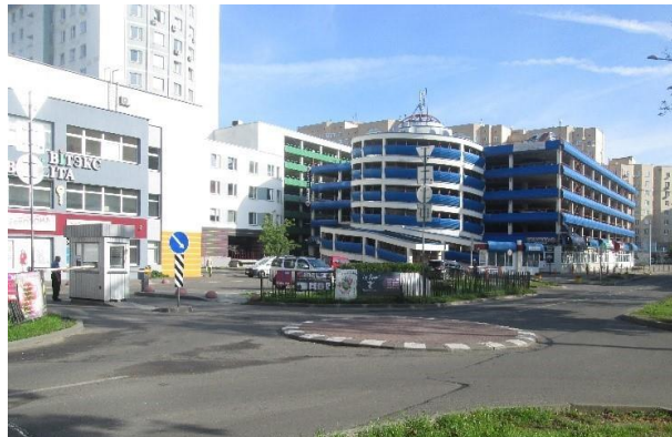
Figure 3. The typical example of the small-radius roundabout's installation in Minsk, Belarus.