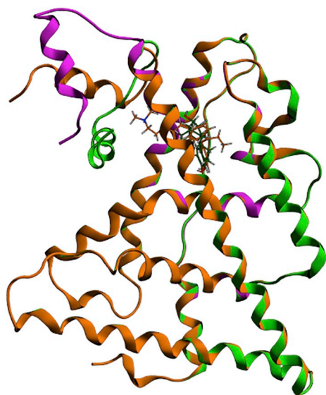
Fig. 1. Superimposition of lower energetic configuration for agonist (green), antagonist (orange) and apo-form (light violet). (For interpretation of the references to colour in this figure legend, the reader is referred to the web version of this article.)

antagonist, so it could be classified as an antagonist. On the other hand, for the five selected putative antagonists (Fig. 2, right), 4 compounds (V9, V10, V11 and V12) have RMSD values very high or comparable with the antagonist reference value, while 1 compound (V8) showed for approx. 50% of generated conformations a low RMSD value, comparable with the agonist value. In this case, we can assess that 4 compounds are antagonists, while the fifth is a weak partial agonist.