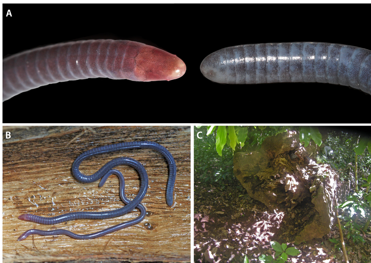
FIGURE 2. Boulengerula spawlsi sp. nov. (A) head and terminus and (B) whole body (with the smaller paratype BMNH 2005.2264) of holotype in life. (C) Habitat at type locality.

In life (Fig. 2A–B the holotype was a slightly purplish blue dorsally, slightly paler on the flanks and below with a pinkish head and throat and a pale snout tip. AGs were whitish with this pale colour extending slightly laterally and ventrally on the last few annuli and also surrounding the slightly darker disc.