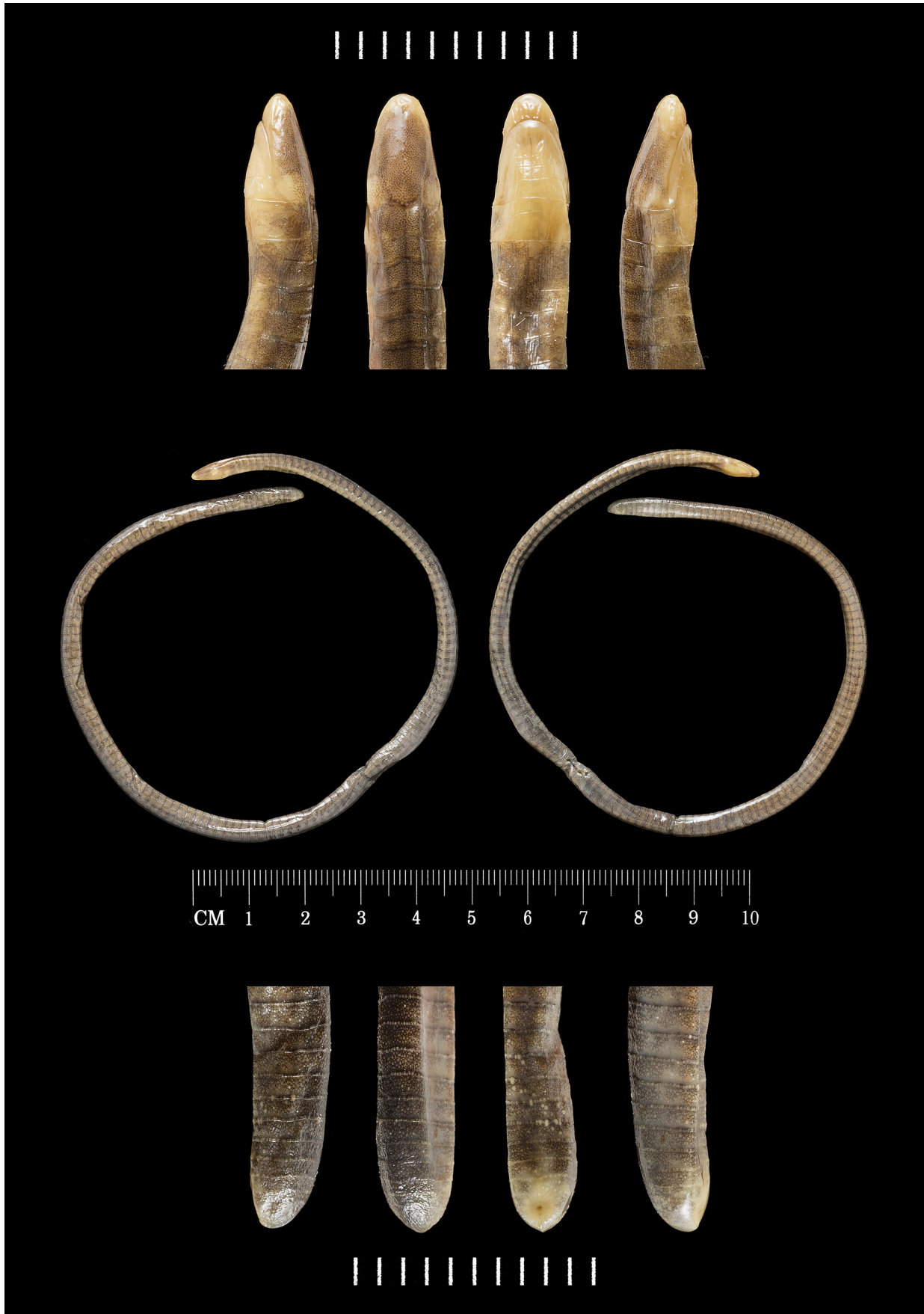
FIGURE 1. NMK A/5596/2, holotype of Boulengerula spawlsi sp. nov. Scale bars in mm.