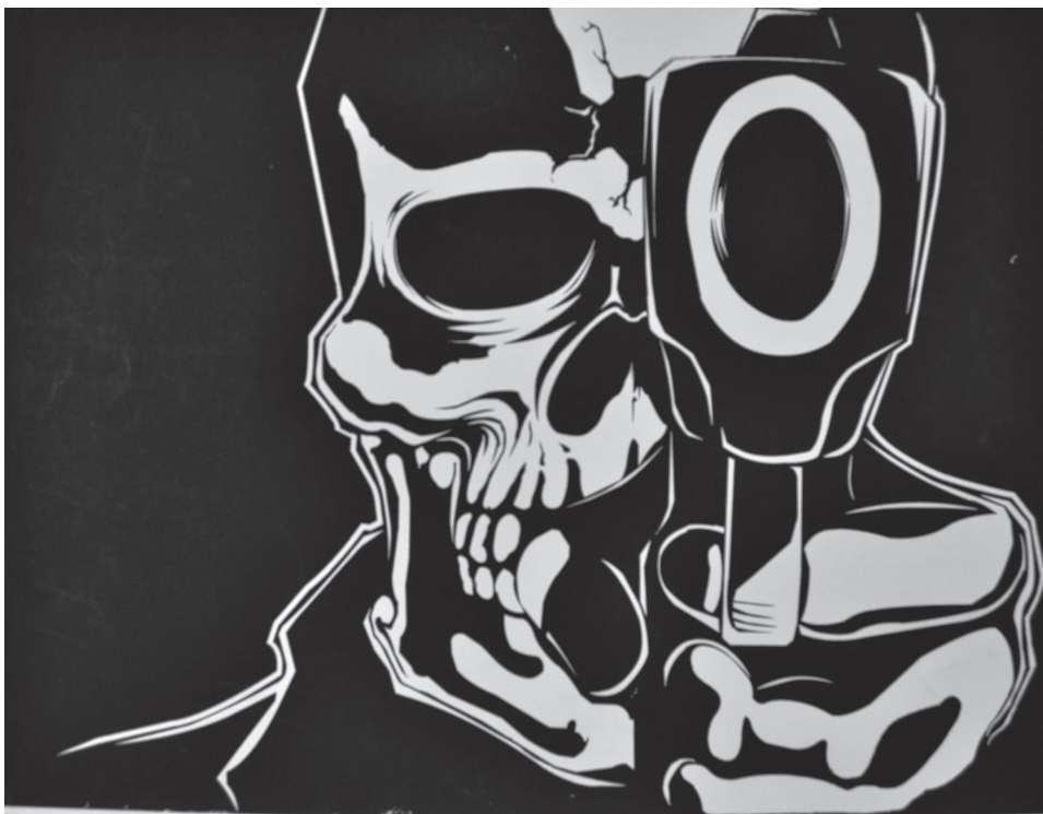
PHOTOGRAPH 1. “El Sicario” (The Hit Man)