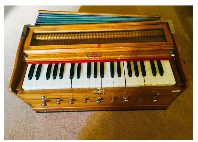
Figure 2: Harmonium.