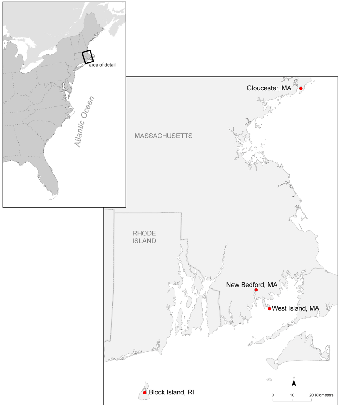
Figure 1. Map of Atlantic coast US study area showing collection sites for Fundulus heteroclitus .