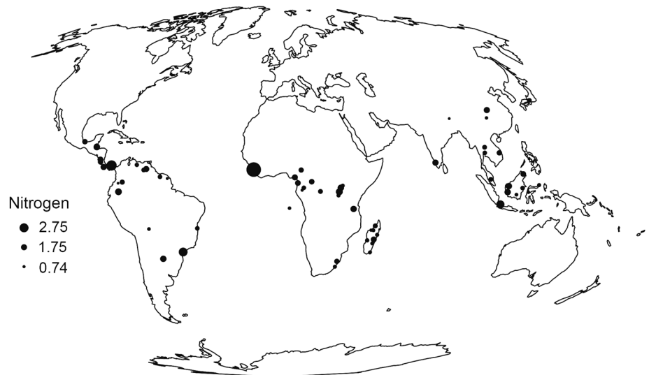
Figure 3. Map representing the 62 locations for which nitrogen records were available. Point size is proportional to the average nitrogen concentration in fruits per site. Studies are listed in Supplementary Table S1. The figure was created using “mapproj” package in R v 3.3.2 ( https://cran.r-project.org/ ).

animals may either shift to more proteinaceous food, such as leaves and/or invertebrates, or increase the amount of food processed. In fact, over-ingestion to meet protein requirements has been observed in frugivorous birds 59 and some primates 10 but see 60 , and a loss of body mass may even occur when protein intake is low despite an energy-rich diet 6 . In line with the nutritional hypothesis, the most frugivorous lemur genera, Varecia and Eulemur (family Lemuridae), are characterized by an “intake” strategy with some of the fastest food passage rates relative to body size recorded in primates 61,62 . Also, most lemurids are cathemeral, i.e. active over the 24 hours, an adaptation that may have helped to further increase both the amount of food processed and the nitrogen intake in animals lacking a specialized digestive system 63 .