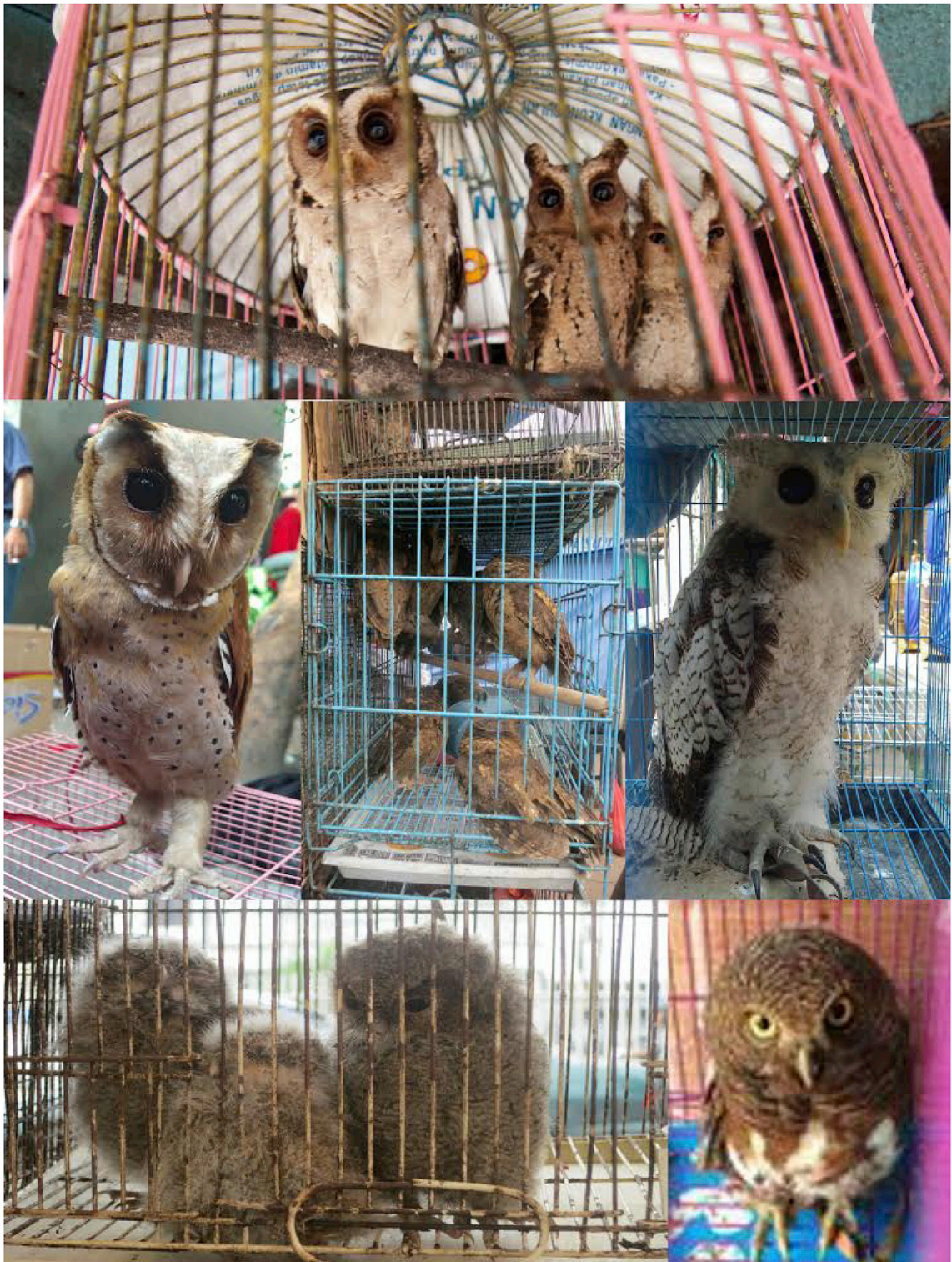
Fig. 3. Owls for sale in bird markets in Java. From top, clockwise. Scops owls, juvenile barred eagle owl, Javan owlet, juvenile scops owls, Oriental bay owl. Centre: scops owls.

this time the first Indonesian pet owl community Facebook pages had been set up, and websites offered advice on how to care for pet owls were available, quite possibly also in response to the Harry Potter films and novels. Furthermore, the availability