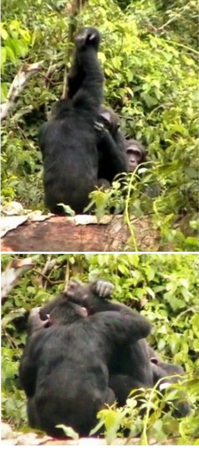
Figure 2a. Adult males Julius (JL) and Keeta (KT) performing grooming hand-clasp (May 2007); behind them a young adult male Murray (MR) is watching observers. JL and KT were the topranked males at Bulindi. Although in this videostill KT (facing camera) appears to rest his wrist on JL's wrist, possibly indicating his dominance (cf. reference 2), subsequent observations of social behavior suggested JL was alpha male (unpubl. data).

GHC is performed usually, but not exclusively, by adults<sup>1,5,8</sup>. While a possible male bias was indicated in some studies<sup>2,9</sup>, adults of both sexes participate in this activity<sup>1,5</sup>. However, particular individuals<sup>9,10</sup> and dyads<sup>5,10</sup> may perform GHC more often than other group members. Adult females at Bulindi were shy of human observers and most grooming observations involved adult males. Thus, further study is needed to establish the occurrence of GHC in females at this site. Two well-observed GHC bouts involved the same two prime adult males (JL and KT) who were also the likely participants in two additional instances. These males performed GHC twice during four well-observed bouts of mutual grooming totalling 157 min. A third prime male (SL) groomed with KT during three bouts (118 min), but they did not perform GHC. JL and SL seldom interacted and were not seen grooming. Two young adult males (MR and JK) and an elderly male