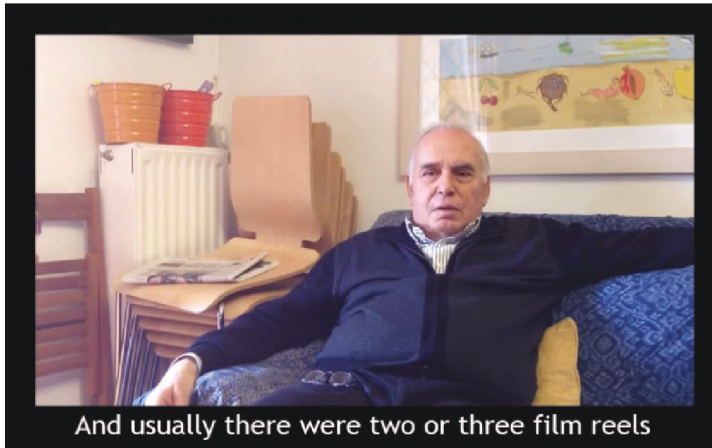
Figure 1. Giuseppe Verrì's memories of parish cinema distribution.

how this impacted the actual cinema viewing experience. One Roman spectator, Giuseppe, recalls reels of films being transported from one cinema to another during the course of a screening (see Figure 1):