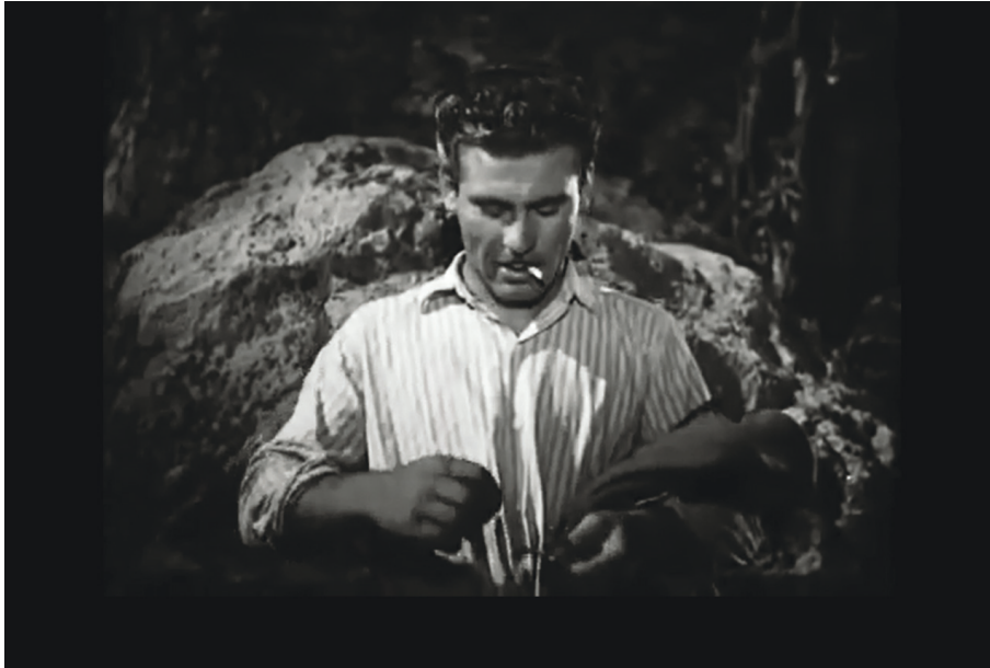
Figure 2. Fragment from Renato Castellani's film Due soldi di speranza (Two Cents Worth of Hope, 1952).

participants – like the audiences represented in the film – were often forced to see parts of films in the wrong order, providing a unique cinema experience they all remember.