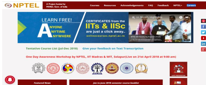
Figure 2: Screenshot of NPTEL