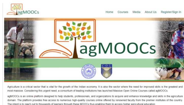
Figure 6: Screenshot of agMOOCs