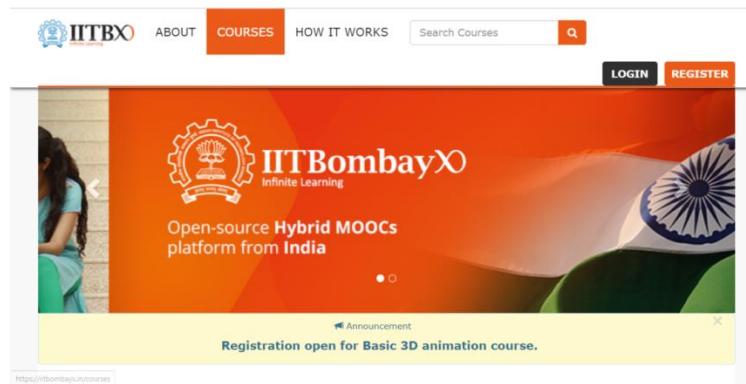
Figure 4: screenshot of IITBX