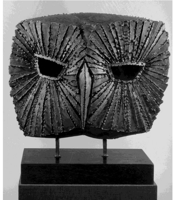
Figure 4. Frosso Eftymiadi-Menegaki, Head of an owl , wrought iron, 58 x 64 x 26 cm. National Gallery – Alexandros Soutsos Museum, Athens. The sculpture was shown in the AGWA's exhibition at Parnassos Literary Society in 1963.

Greek producers. Thus, artists were often classified within specific trends, while at the same time personal investigations and solutions were taken into consideration for thorough evaluation of their art.