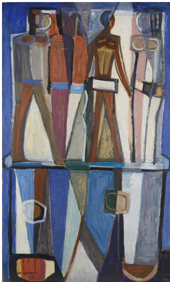
Figure 3. Eleni Stathopoulou, Swimmers . (1957), oil on hardboard, 162.5 × 97 cm. Private collection, Athens. The painting was shown in the AGWA's exhibition at Zygos Gallery in 1957.

for their choice to work on a common iconographical theme, i.e. a composition with human figures (Fig. 3); such a move indicated, as she pointed out, an exceptional courage on the part of women artists, who could be led to new challenges and interesting explorations. 57