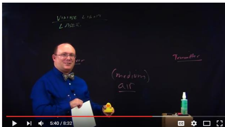
Figure 3: The Lightboard used as a tool for ‘floating’ labels over physical objects

Further evolution of the Valparaiso University Lightboard suite may include incorporation of the One Button Studio recording platform [7], to further ease and simplify solo operation of the system. Immediate plans include advertising the facility more widely around campus, and providing information to new hires alongside the other teaching and instructional technologies available on campus. There has been discussion of using the system to link to a remote classroom, for synchronous distance education, to leverage the multiple sites available to the University, which has an offsite facility in a nearby metro area particularly well placed for attracting currently employed students as well as several study abroad sites.