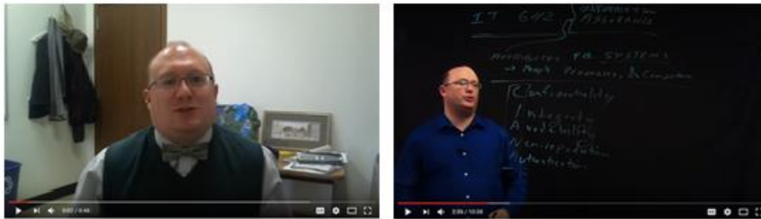
Figure 1: Side by Side Comparison – Standard web camera versus a Lightboard

Even though IT 642 does not have the mathematical or diagram driven-example questions for which Lightboard videos have often been user, it was adopted for the course. The results from this test largely confirms the low barrier to entry for this technology and also demonstrate its utility in areas beyond those original strengths - beyond those originally suggested for the system. These needs could not be met effectively with a web camera, document camera, or screenshots, the other available options. Additionally, the general circumstances for this created a situation that is distinct from most other, earlier Lightboard setups, which have often been built as a student experiment or with greater staff and budget availability [2,3,9,10].