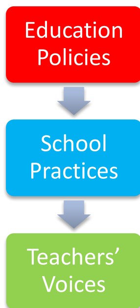
Figure 2. Relationships between education policies, school practices, and teachers' voices.

The implications of the required multicultural education course for teacher preparation arose from the participants' responses. It is necessary for teacher education programs to develop preservice teachers' knowledge and skills to better interact with students from culturally diverse backgrounds and to include courses that better address multicultural education in the increasingly multicultural society of Taiwan. Even though the teachers mentioned some subjects that had incorporated multicultural education in recent years, most teachers were unfamiliar with the implementation of multicultural education and had concerns due to their lack of information and knowledge regarding the subject. As a result, it is difficult for them to develop the appropriate curricula and implement multicultural education in their classrooms. At present, there are no multicultural education curriculum development guidelines or information in teacher