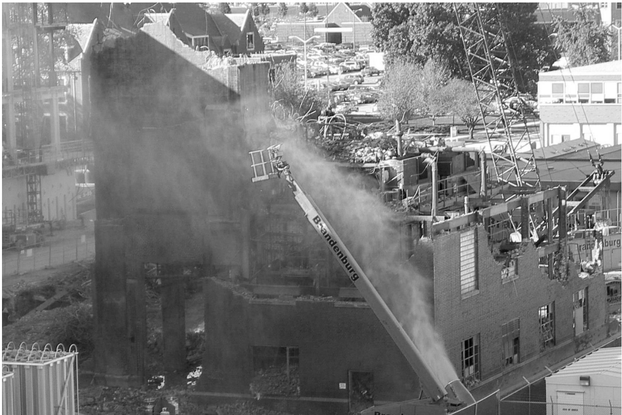
Figure 1 – Atomized Spray Dust Control

Atomized spray techniques rely on the principle of creating very small water droplets. The water droplets are launched from a powerful fan at moderate to high velocity, facilitating a collision with airborne dust particles to drive them to the ground. This method has proven very effective in demolition applications, providing dust control by surface wetting as well as airborne particle capture (Peterson, Shaurette, and Clarke, 2009).