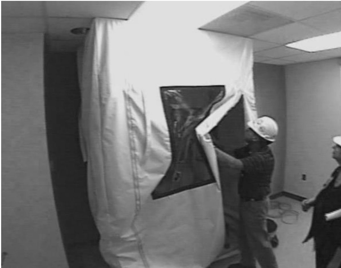
Figure 5 – Containment Cart

the containment cart to the ceiling using built-in corner supports and exhausting the air within the cart through a HEPA vacuum, worker can perform tasks above a suspended ceiling without exposing the surrounding area to potential contamination. These temporary containment areas can be installed for work requiring as little as an hour or two of construction or repair.