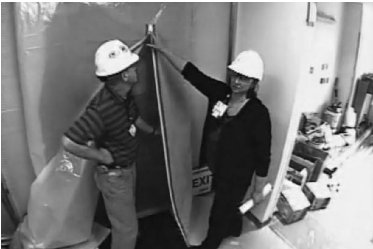
Figure 4 – Dust Barrier at Door

In addition to creating and monitoring negative air pressure in the construction zone, the infection-control plan will require extensive containment procedures. Containment procedures include sealing all connections with the ventilation system (Figure 3), installation of dust control partitions of either hard walls or plastic film barriers (Figure 4), controlled access to and from the construction area, and limitations on construction traffic through unaffected portions of the building.