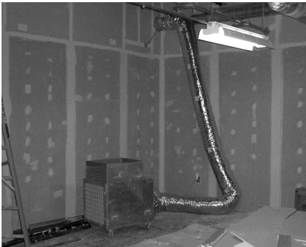
Figure 2 – Negative Air Pressure HEPA Filter

Individuals (especially children) with compromised immune systems are more susceptible to infection, making dust control activity in and around healthcare and childcare facilities of critical importance (Lenhart, et al., 2004). The use of atomized spray dust control equipment on the project adjacent to a paediatric hospital shown in Figure 1 was able to capture dust particles and bring them safely to the surface of the ground under most conditions. Nevertheless, on windy days the competent person assigned to site safety monitoring needed to discontinue operations until the wind subsided and the dust control measures could be effective.