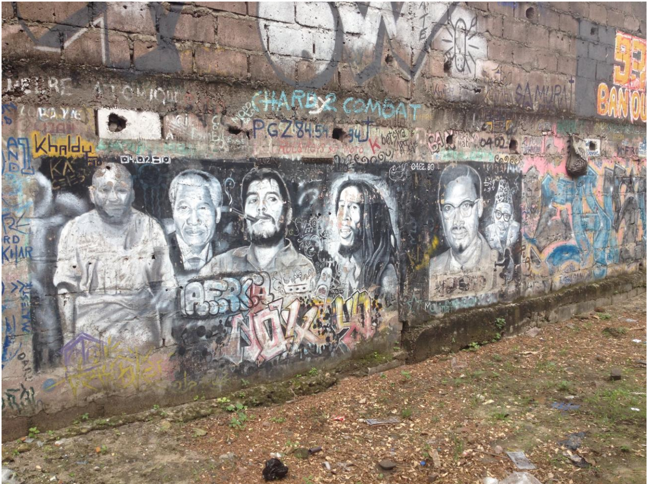
Figure 2. Anonymous mural photographed by the author at Académie des Beaux-Arts, Kinshasa in 2016.

The “figure” of Lumumba, in its many contradictory forms, is par excellence an interstice between art and history that mediates between past, present and future, what I would call a “mediating interstice”. First of all because he himself is a figure of transition between colonial and postcolonial times, moving from someone who approved of the politics of assimilation in 1955 to becoming a nationalist independence leader in 1958. He decolonized himself before attempting to do so with his country. This immediately explains his relevance for artists today: the transition is yet to be completed, if it is possible at all. If Lumumba is alive today and remains an icon for many artists in