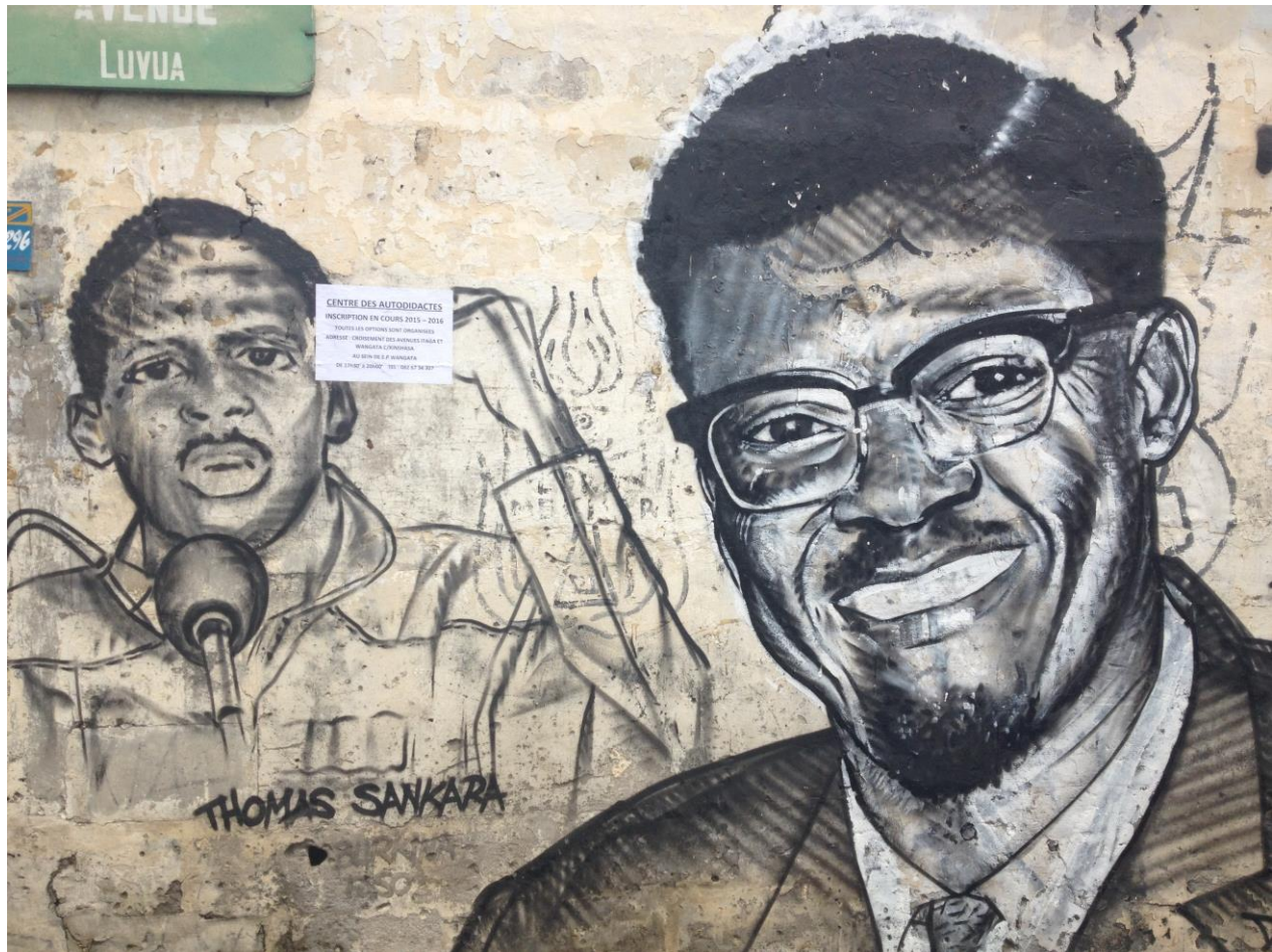
Figure 3. Anonymous mural photographed by the author at Lingwala, Kinshasa, in 2016. Photograph © Matthias De Groof.

Lumumba’s figure subjectively recalls the ghosts from the past before going forward and presenting a vision of the future. The past has to be redeemed before changing the present and turning to the future.