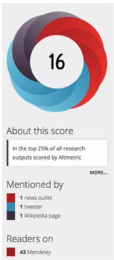
Figure 1: Altmetrics information from Altmetric for the article “Male and Female Brain Evolution is Subject to Contrasting Selection Pressures in Primates” published in BMC Biology , 2007. dx.doi.org/10.1186/1741-7007-5-21

ImpactStory is another altmetrics provider, although this service is directed at the authors rather than the journals. Users of ImpactStory can input their own citations and links to their articles and ImpactStory will gather various metrics and generate a report for the user. ImpactStory is often used to create an author profile that shows an overview of the impact of an individual scholar's research work. Each article listed in a profile can be explored for altmetrics from a variety of sources; the article and the author can be compared with the rest of the userbase of ImpactStory as a percentile ranking. See Figure 2.