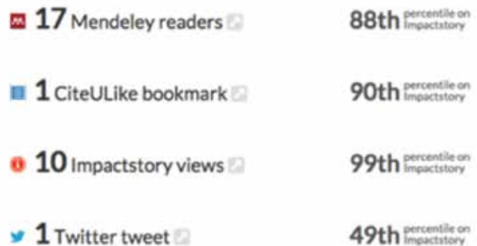
Figure 2: Altmetrics data and ranking for an article in ImpactStory . ( https://impactstory.org/lbcollister/product/6ov0voc8w7lbuiv2tdgx-bx3z/metrics )

stand the relationship of altmetrics and citations, altmetrics remain a powerful tool for assessing impact beyond citation counts and academia. As more journals provide altmetrics data for their articles, these tools can provide a more complete picture of the impact of research in a variety of different fields and help scholars tell the story of their research.