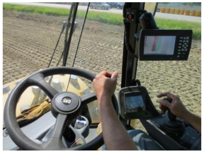
\label{eq:Figure 2 GPS} Figure \ 2 \ GPS \ \text{mapping systems can help operators visualize the work in real time}

additional soil already worked. So MDP is giving you information about the soil you are working NOW, not an average of several layers.