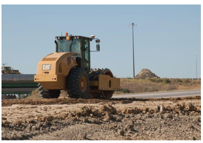
FIGURE 1 PADFOOT VIBRATORY SOIL COMPACTOR USING MDP TECHNOLOGY ON COHESIVE SOILS - IOWA USA

Caterpillar developed MDP (Machine Drive Power) technology to fill this gap. Rather than an accelerometer and vibratory drum, it uses the principle of rolling resistance to provide indications of soil stiffness. This allows it to perform more reliably on cohesive and granular soils with less variability than accelerometer systems. It also means that the technology can be used on both vibratory and static drum compactors, which are often used on larger sites. While the technology is quite useful on its own, it is even better as a complementary technology to the existing accelerometer-based systems. Contractors who use vibratory soil compactors equipped with MDP and accelerometerbased measurement systems enjoy the widest application range, able to ensure uniform, high quality compaction on nearly any soil type.