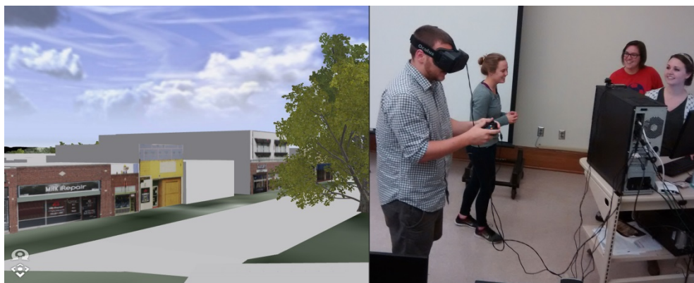
Fig. 2: CityEngine project in ESRI WebViewer (left) and a student using the Oculus Rift (right)

The combined efforts of all groups resulted in a final product. This product included updated datasets for all networks, estimated building heights (with detailed inventory of building heights in AggieVille), and a large set of façade images which were digitally modified to reduce visual noise (pedestrians, vehicles, etc.). Several groups attempted to create custom rules from which to apply surfaces, textures and models to the GIS data. While it is easy to create cities from Wizards and use built-in rules from ESRI, these rules did not apply directly to GIS-based data. Thus, learning how to code in CGA (CityEngine proprietary language) in the shortened time period proved challenging for students. The program was seemingly cumbersome, published help limiting, and even with good support from ESRI (10 support tickets opened for the project) the end product was not as students or faculty hoped. Nonetheless, a product was developed (Fig 2, left). Early test porting CityEngine to the Unity Gaming Engine did function, but the final CityEngine models were unable to be migrated due to lack of time. However, students did receive a demonstration with Oculus Rift (Fig 2, right), so the process of planning, to gaming and then virtual reality was understood. The primary problem with importation of the final CityEngine problem into Unity was a result of incompatibilities of CityEngine and Unity, resulting in too many topological errors between roads and terrain.