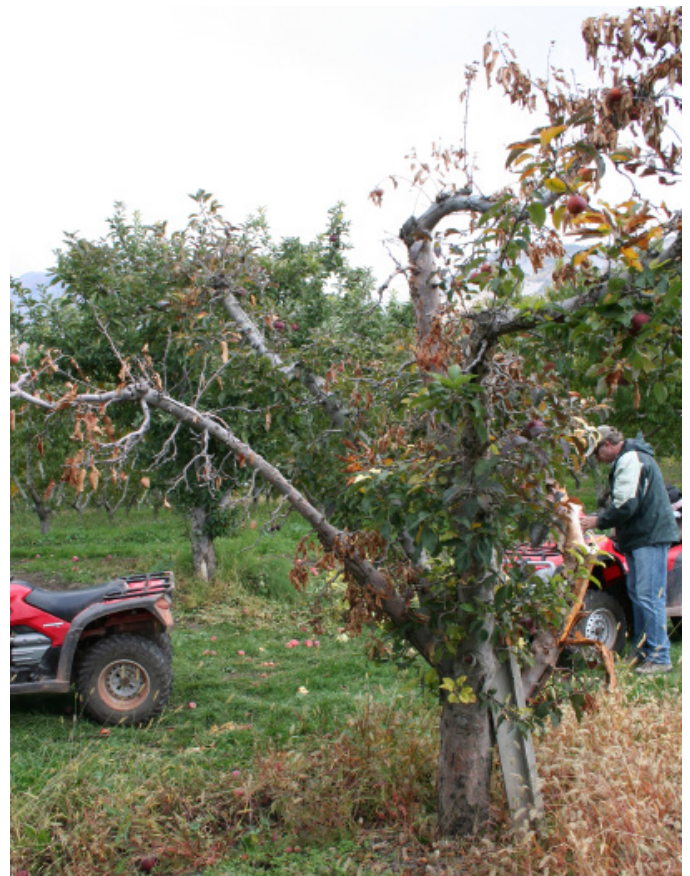
Fig. 8. Heavy damage from VLB can cause thinning, wilted, or yellowing canopy.