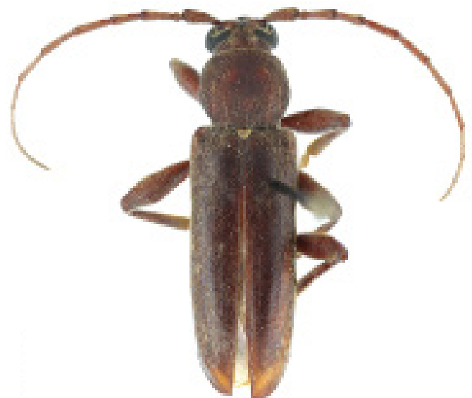
Fig. 2. VLB adult.

The velvet longhorned beetle (VLB), Trichoferus campestris (Faldermann) (Coleoptera: Cerambycidae), is an invasive wood-boring pest that is native to Asia and Russia. It infests fruit, forest, and ornamental trees, as well as green and dry wood, such as timber and lumber. VLB was first detected in North America in Quebec in 2002, and in the U.S. in Rhode Island in 2006. It has been detected/intercepted in a few other states, mostly in the Midwestern and Eastern U.S., but also in Utah (since 2010). In Utah, VLB is currently found in some orchards, ornamental landscapes, and along natural waterways (Utah, Salt Lake, Davis, and Tooele counties). It spreads to new areas through firewood or infested wood packing material used for imported commodities. Contact the Utah Plant Pest Diagnostic Lab at Utah State University or the Insect Program at Utah Department of Agriculture and Food with any suspect VLB.