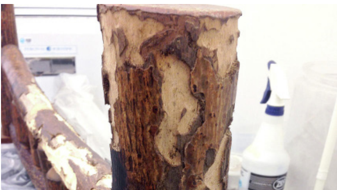
Fig. 7. Larval galleries on rustic log furniture imported to the U.S. from China.