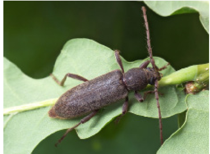
Fig. 1. Velvet longhorned beetle (VLB) adult.