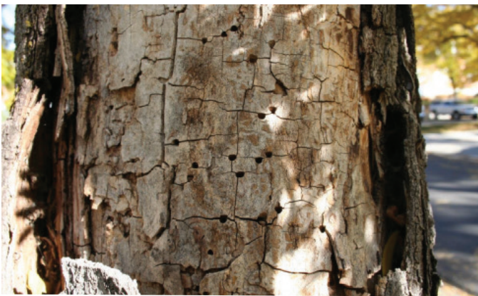
Fig. 6. Adult exit holes are round and about 3/8 inch in diameter.