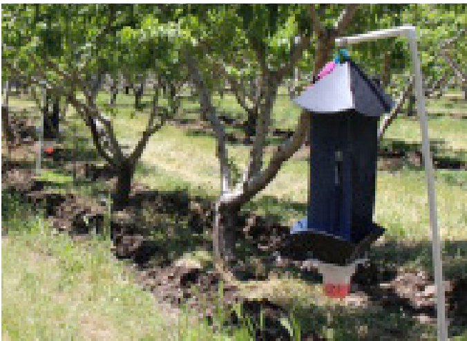
Fig. 9. Cross vane panel trap.

The best time of year to monitor for VLB is during peak flight from late June to early August. In Utah, high numbers of VLB have been detected in riparian habitats near golf courses and near cull and plant debris piles in commercial fruit production areas. Monitoring in Utah has been successful with Lindgren funnel or cross vane panel traps baited with an ethanol lure (Fig. 9). In addition, Fluon® or Teflon™ should be applied to the surfaces of panel traps to prevent the beetles from escaping the trap. An insecticide vapor strip or ethylene (toxic to mammals) or propylene (nontoxic) glycol should be used in combination with traps to kill trapped insects. Other monitoring methods include visual inspection for adult exit holes and tree injury symptoms (as described previously), and black light infrared trapping (using either commercially or homemade manufactured black light traps).