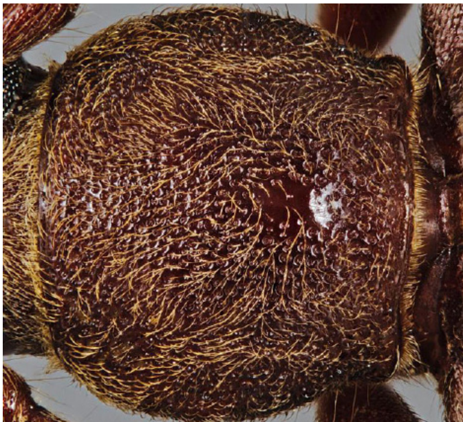
Fig. 3. Close up of fine hairs on body of adult VLB.

The name “velvet” comes from the fine hairs that are irregularly distributed and form light colored “patches” along the body and wing covers (Fig. 3).