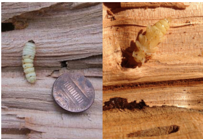
Fig. 4. VLB larva (left) and pupa (right).

Pupae are about 3/4 inch (20 mm) long and 1/4 inch (5 mm) wide, and have a white to cream colored body (Fig. 4).