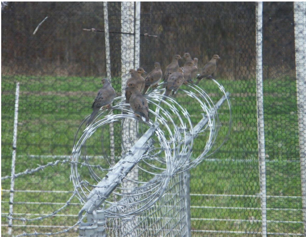
Figure 1. Mourning doves ( Zenaida macroura ) perched on the Razor-ribbon™ Helical razor-wire during the experimental period.

* During the pre-treatment period, the fences where the razor-wire was attached (for the post-treatment period) were controls.