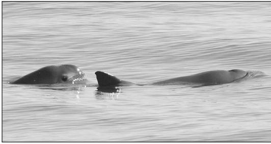
Figure 1. Vaquita ( Phocoena sinus ) swimming in the Upper Gulf of California.

for the Recovery of the Vaquita) in 2015 estimated that the entire world populations may consist of <30 individuals (Jaramillo-Legorreta et al. 2017).