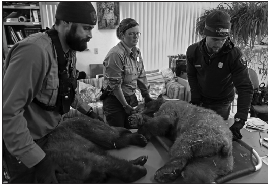
Figure 2. Managers at Yosemite National Park, California, USA fitting yearling bears ( Ursus americanus ) with global position system collars at Lake Tahoe Wildlife Care, Inc. in January 2017 (photo courtesy of D. Wharton).

contained both GPS and VHF functionality.