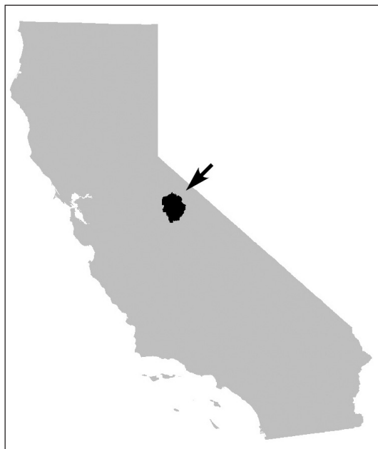
Figure 1. Yosemite National Park, California, USA, covers 3,080 km 2 on the western slope of the Sierra Nevada in California.

dumpsters, or a bear entering a building” (NPS 2002a).