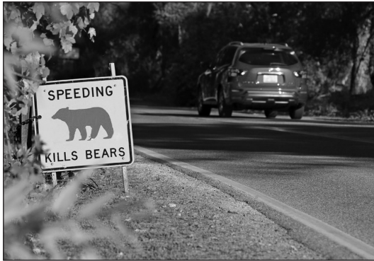
Figure 3. A “Red Bear Dead Bear” sign at Yosemite National Park, California, USA, set up at the location of a vehicle–bear ( Ursus americanus ) collision (photo courtesy of D. Wharton).

results of our management actions was to evaluate the success of our efforts to rehabilitate 3 yearling bears that were orphaned as cubs. As previously described, we sent these bears to a rehabilitation center as cubs in 2016 after a vehicle struck and killed their mother. Upon their return to the park in January 2017, we fitted the yearlings with GPS collars prior to denning them so we could evaluate the success of the effort. Although we had rehabilitated cubs and then released them as yearlings in the past, we had relied on VHF collars to monitor post-release movements, and this was limited in scope (NPS, unpublished data).