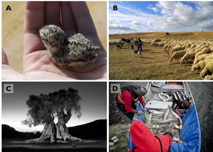
Fig. 2. Examples of relational values. (A) A young water bird ( Charadrius sp.) in a human hand illustrates stewardship of nature. In the parlance of relational values, regardless of a thing's current state, what matters most is humans' responsibilities, which stem from our relationships with that thing. (B) Transhumant shepherds and sheep dogs on their annual migration on the Iberian Peninsula. The relationship goes beyond management for human benefit, reinforcing cultural identity through active ritual care. (C) Ancient olive tree on Aigina Island, Greece, 1,500–2,000 years old. The tree is no longer harvested but has great symbolic significance for island people. (D) Salmon fishing on the west coast of North America is particularly rich in relational values due to benefits and values such as sustenance, identity, and strengthening of social ties.

into the instrumental framing of ecosystem services because they are inherently relational: cultural services are valued in the context of desired and actual relationships (Fig. 1).