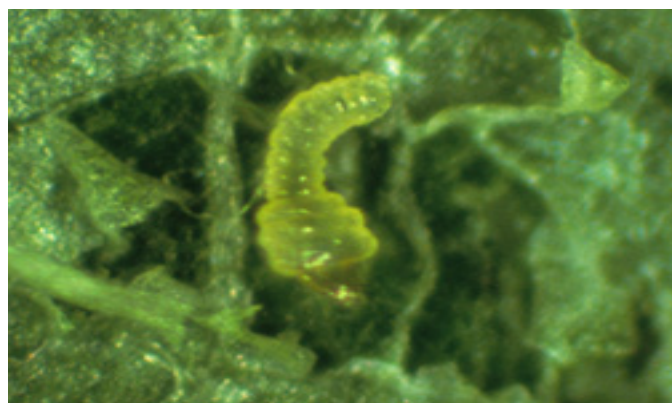
Sap-feeding larva within its mine.