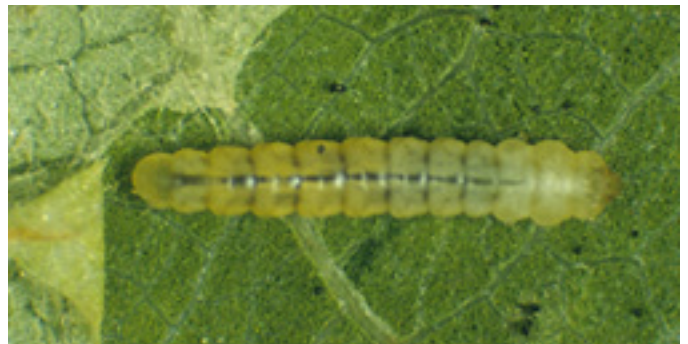
Tissue feeding larva forms tent-like mines.