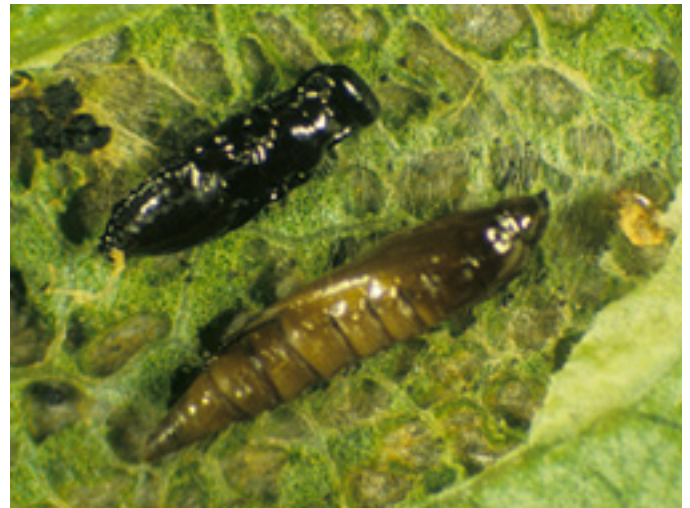
Pnigalio flavipes pupa (top) compared to leafminer pupa (E. Beers, Washington State University).

Precautionary Statement: Utah State University Extension and its employees are not responsible for the use, misuse, or damage caused by application or misapplication of products or information mentioned in this document. All pesticides are labeled with active ingredients, directions for use, and hazards, and not all are registered for edible crops. "Restricted use" pesticides may only be applied by a licensed applicator. The pesticide applicator is legally responsible for proper use. USU makes no endorsement of the products listed herein.