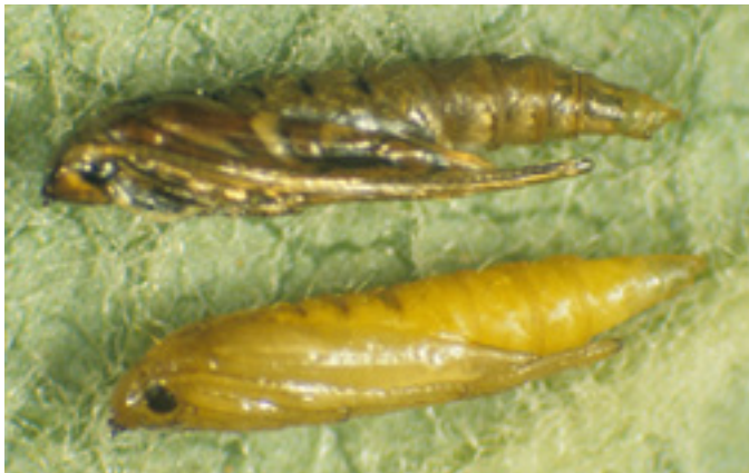
Mature pupa (above) and newly formed, light-colored pupa (below).