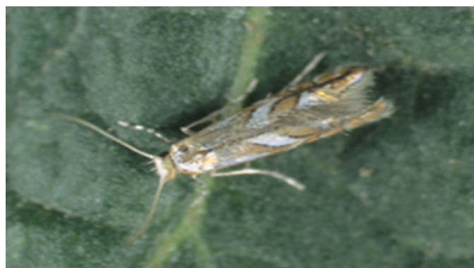
Adult moths are tiny (1/8 to 1/5 inch long) and can be found resting on leaves and flying in the orchard (E. Beers, Washington State University).

Western tentiform leafminer populations can vary tremendously between years or even between generations within a single year. A large population in Utah's commercial fruit districts hasn't been observed since the early 2000s. Increasing resistance to organophosphate insecticides and variable effectiveness of at least six parasitic wasp species that attack the leafminer can influence the population size.