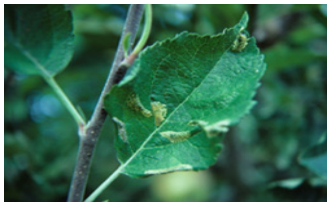
Apple leaf with western tentiform leafminer tissue-feeding mines.