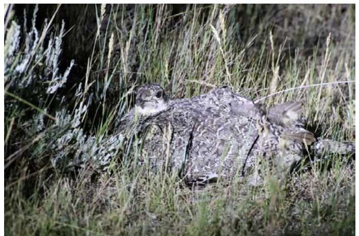
Figure 3. Greater sage-grouse female with a rump-mounted solar-powered GPS radio on her back.

Because all projects have limited resources, biologists mark a very small portion of the overall population when conducting wildlife radio-telemetry studies. In our experience, we generally radio-mark less than 2% or so of the population at any given time. This means that most (i.e., at least 98%) individuals in a population are not directly represented by the collected data. We cannot be sure of the location and habitat selection of the unmarked individuals. Thus, telemetry bias raises important questions about how well the entire population is represented by data when just a small portion of the population is radio-marked.