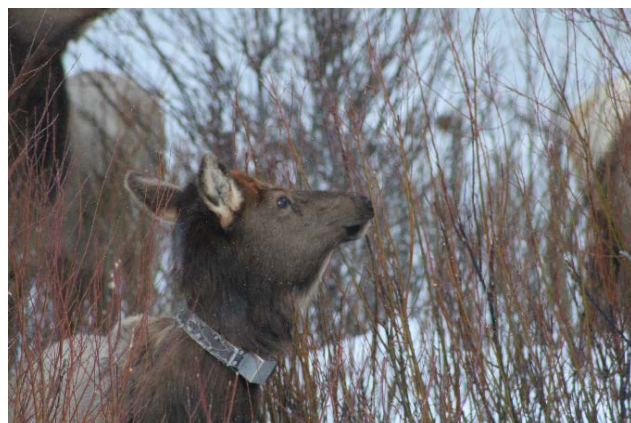
Figure 1. Cow elk ( Cervus canadensis ) with a necklace-style radio-transmitter.

For the first few decades only very high frequency (VHF) radios were commonly available. Telemetry works in a manner similar to any radio system. There is a transmitter source sending out a signal at a given frequency (e.g., a radio “station”) and a receiver (e.g., a vehicle’s radio) is tuned to that frequency allowing us to hear the signal (e.g., music or talk show). Biologists attach radio-transmitters to animals, often a neck-lace style is used (Figure 1), and then a hand-held receiver and directional