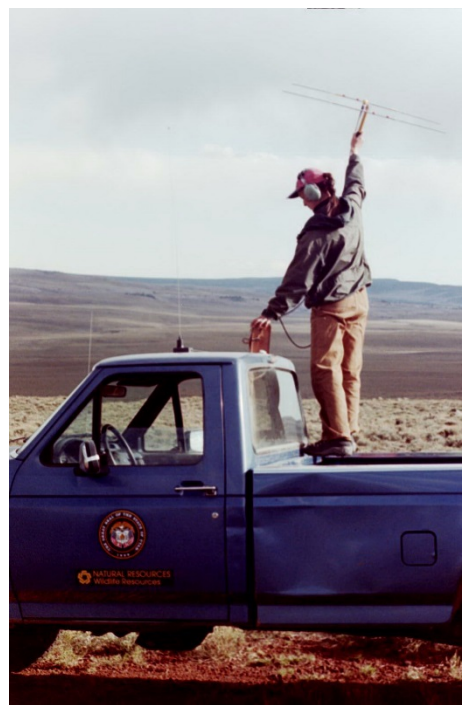
Figure 2. A biologist using a VHF directional antenna and receiver to detect signals from radio-marked greater sage-grouse ( Centrocercus urophasianus ).

The VHF radio-transmitters emit a signal at a predetermined rate; e.g., one pulse per second, and when detected by a receiver the signal produces a “beep.” If a directional antenna is used, the biologist can triangulate the signal (i.e., using the bearings of the signal from different locations around the