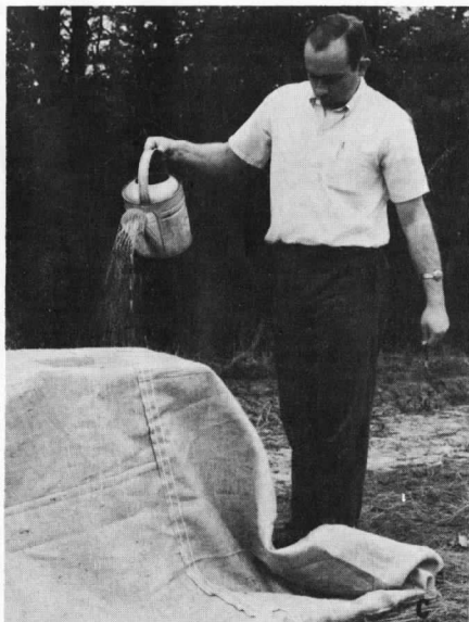
Confine bees to hives when hazardous pesticides are to be applied: A and B, Covering hives with burlap; C, soaking the burlap with water.

as much as dusts and, consequently, are less likely to harm bees. Granules are usually harmless to bees.