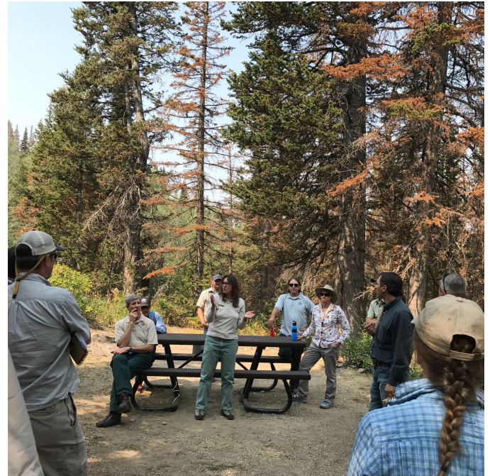
Figure 7. Utah partnership of interested agencies and stakeholders attended a tour of balsam woolly adelgid damaged sites in Farmington Canyon, September, 2017.

A Utah partnership has been formed to implement survey, research, education and management efforts for BWA. Led by the Utah Department of Agriculture and Food, members represent concerned organizations including the United States Department of Agriculture (USDA) Forest Service; the Utah Division of Forestry, Fire and State Lands; Utah State University Extension; USDA Animal and Plant Health Inspection Service; and ski resorts (Fig. 7). This group is coordinating efforts to secure grant funding to study BWA and its impact in Utah, and to develop public educational resources.