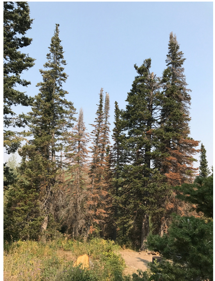
Figure 1. A subalpine fir stand infested with balsam woolly adelgid.

The balsam woolly adelgid, Adelges piceae (Ratzeburg) (Hemiptera: Adelgidae), is a tiny sucking insect that was introduced to North America from Europe. In the U.S., it is a serious pest of true firs in forests, landscapes, and in seed and Christmas tree production. In some areas of North America, BWA has completely removed true firs from forest stands. In Utah, subalpine fir ( Abies lasiocarpa ) is a highly susceptible host tree; white fir ( A. concolor ) is also a host but is more tolerant. Douglas-fir ( Pseudotsuga menziesii ) is not a true fir and is not affected by BWA. The USDA Forest Service Forest Health Protection (FHP) team in Ogden first detected and confirmed BWA in the mountains above Farmington Canyon (Fig. 1) and near Powder Mountain Resort. It is now confirmed in Box Elder, Cache, Rich, Weber, Davis, Morgan, Salt Lake and Summit counties. Subalpine fir typically grows at elevations above 7,500 ft, and until now, has been one of the few forest tree species that has resisted large-scale pest infestations.