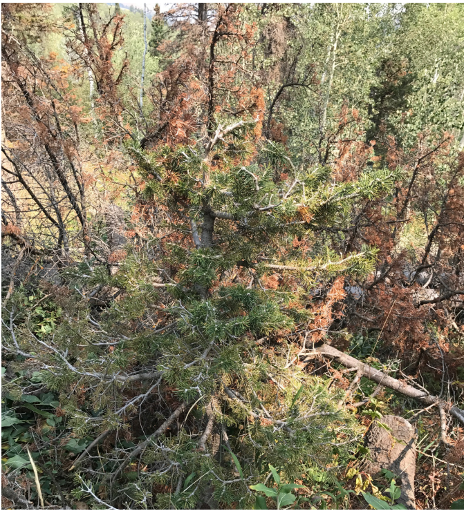
Figure 6. Young subalpine fir infested with balsam woolly adelgid; note severely stunted growth.

farms and in urban settings. Including other management techniques, such as planting non-host trees, can prove useful since chemical treatments would be indefinite, costly, and ongoing.