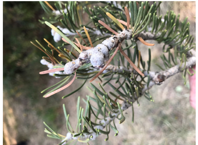
Figure 3. Abnormal swelling, or gouting, of fir branches caused by feeding injury from the balsam woolly adelgid.

In its native range, BWA alternates between spruce and fir; however, in North America, BWA remains on fir as its European spruce host is not present. BWA populations in