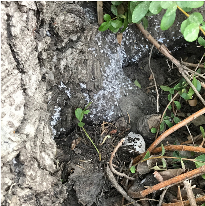
Figure 2. White woolly masses of balsam woolly adelgid on a fir trunk collar.

Stem or bole infestations tend to be more serious than crown infestations, and can result in wide, irregular growth rings and reddish, brittle wood called "rotholz". Host responses to BWA feeding eventually cause decreased water flow to the crown, leading to tree death. Tree mortality typically occurs within 2-10 years of infestation; heavy infestations can kill trees in 2-3 years.