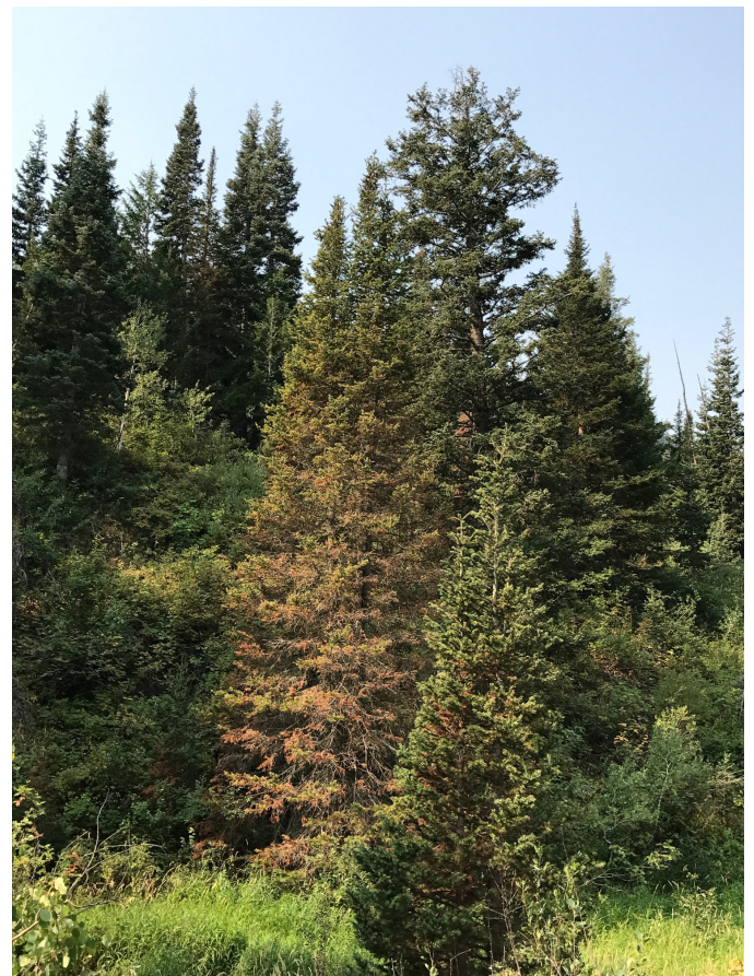
Figure 4. Subalpine fir tree canopy decline; note dying lower branches and green top leader.

North America are composed of females reproducing without mating (parthenogenesis); sexual reproduction requires the European spruce host.