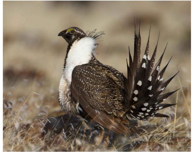
Figure 2. Many wildlife species, including the greater sage grouse, have nearly complete reliance on sagebrush. These animals cannot survive in areas where sagebrush does not exist. Photo by Stephen Ting, Fish and Wildlife Service. Public domain.

Climate change casts uncertainty over sagebrush conservation and restoration efforts and may also alter how historic land-use practices affect sagebrush communities. Given predicted changes, which species and subspecies of sagebrush will decline, persist or even thrive? Where are management efforts likely to achieve benefits over the long-term? Using “best available science” is a