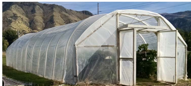
Figure 1. A 2-season high tunnel used for raspberry production.

In a second study, 'Caroline' and 'Josephine' were planted in two replicate 2-season high tunnels (Figure 1) as well as comparison field plots. Two slightly different tunnel designs were used for the 2-season high tunnels: (14.5 ft wide x 10 ft tall x 40 ft long) and (17.5 ft wide x 9 ft tall x 44 ft long) . The 2-season tunnels both had 1 row of each 'Caroline' and 'Josephine'. Rows were 42 ft long and 7 ft apart. The 2-season tunnels were only covered in the fall and early winter in an attempt provide