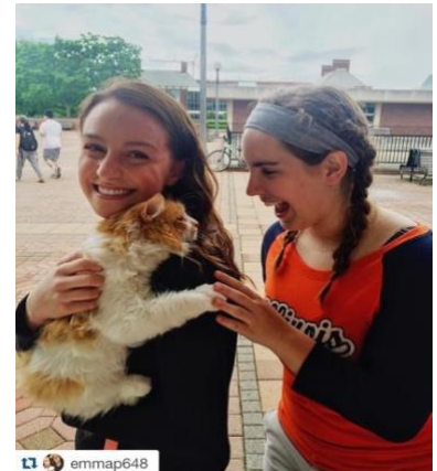
Figure 2: Uggles with students during Meet & Greet

One of the UGL's most successful events every year is Therapy Dogs, when animals and owners from a local therapy-pet group visit the UGL, along with other campus libraries, during finals week. In May 2015, the UGL decided to partner with the campus health and counseling centers and turn the event into a De-Stress Fest, complete with stress management techniques, coloring books, and an Uggles Meet and Greet. The Social Media Team wanted to take advantage of the Uggles momentum and use the popularity of the video to strengthen the outreach for this recurring event as well as to cement campus partnerships. The event saw a high turnout (about 200 students). Students were encouraged to take selfies with Uggles and post them on social media with the hashtag #AskUggles, so the Social Media Team could later find and repost images from the event.