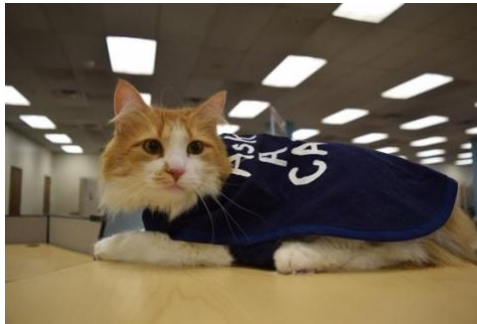
Figure 1: Uggles during marketing video filming

on April Fool's Day, which would signify the lightheartedness of the video and make clear that the UGL had not really hired a new feline employee. The team prepared a series of posts for Facebook, Twitter, Instagram, and Wordpress to showcase the video. Prior to the initial release of the video, teasers were posted on the platforms to create excitement and pique interest. The team also reached out to other libraries on campus to inform them of the campaign and to ask them to share the video on their platforms as well.