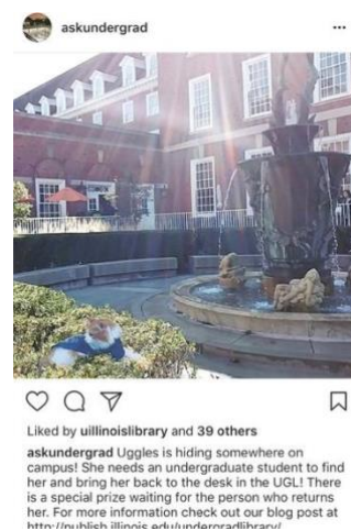
Figure 4: Find Uggles contest featured on Instagram

Although Uggles was already well known within the library system and among many of the undergraduate students, Uggles's popularity really took off once Uggles began "hiding" around campus. The UGL Instagram account saw a dramatic increase of followers and interaction on posts in the form of likes and comments. When the contest wrapped up at the end of the year, many students reached out to ask if Uggles would be hidden again next year, eager for their chance to find our catbrarian. One current student informed us that their younger sister decided to attend the University of Illinois because of the UGL's use of cats on social media, saying that Illinois seemed more engaging and "fun" than other schools they were considering.