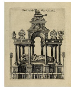
Illustrated below: Monument to Queen Elizabeth I. She was extremely popular, and was known as the Virgin Queen.

Under Elizabeth, the English Church assumed many of the characteristics that were to typify it until the middle of the seventeenth century. In particular, the Queen used the church as a source of patronage and revenue - Elizabeth did have some religious beliefs but not ones that clashed with using the revenues from church land and offices to support secular ends.