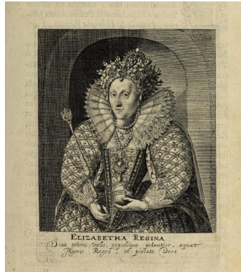
Illustration left: Queen Elizabeth I (1533-1603). She was the last Tudor monarch, and the last monarch before King James VI and I.