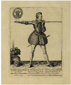
Illustration left: Henry Fredrick, Prince of Wales. Eldest son of King James VI and I, he was extremely popular with the people, and was the heir apparent to the throne.