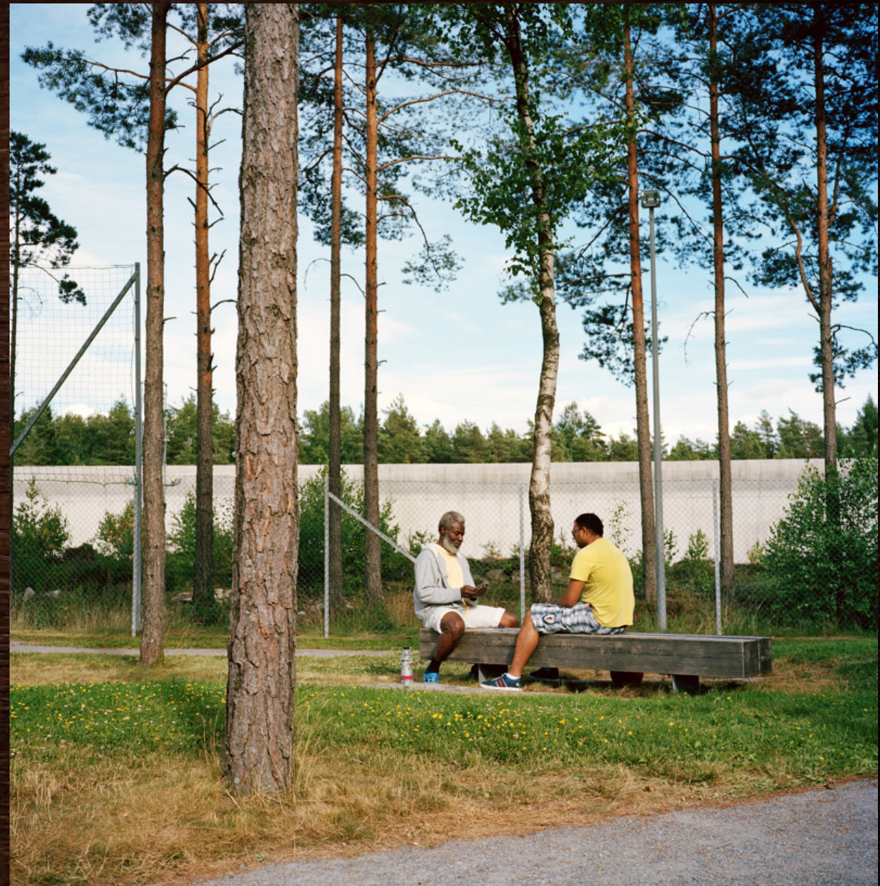
Halden Prison - Norway