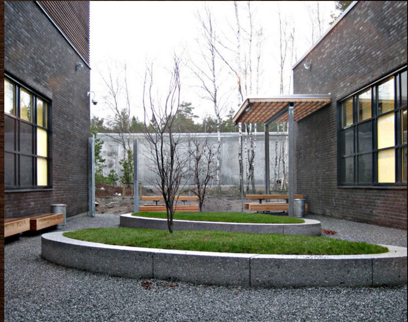
Halden Prison - Norway