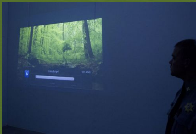
Snake River Correctional Institution - Oregon