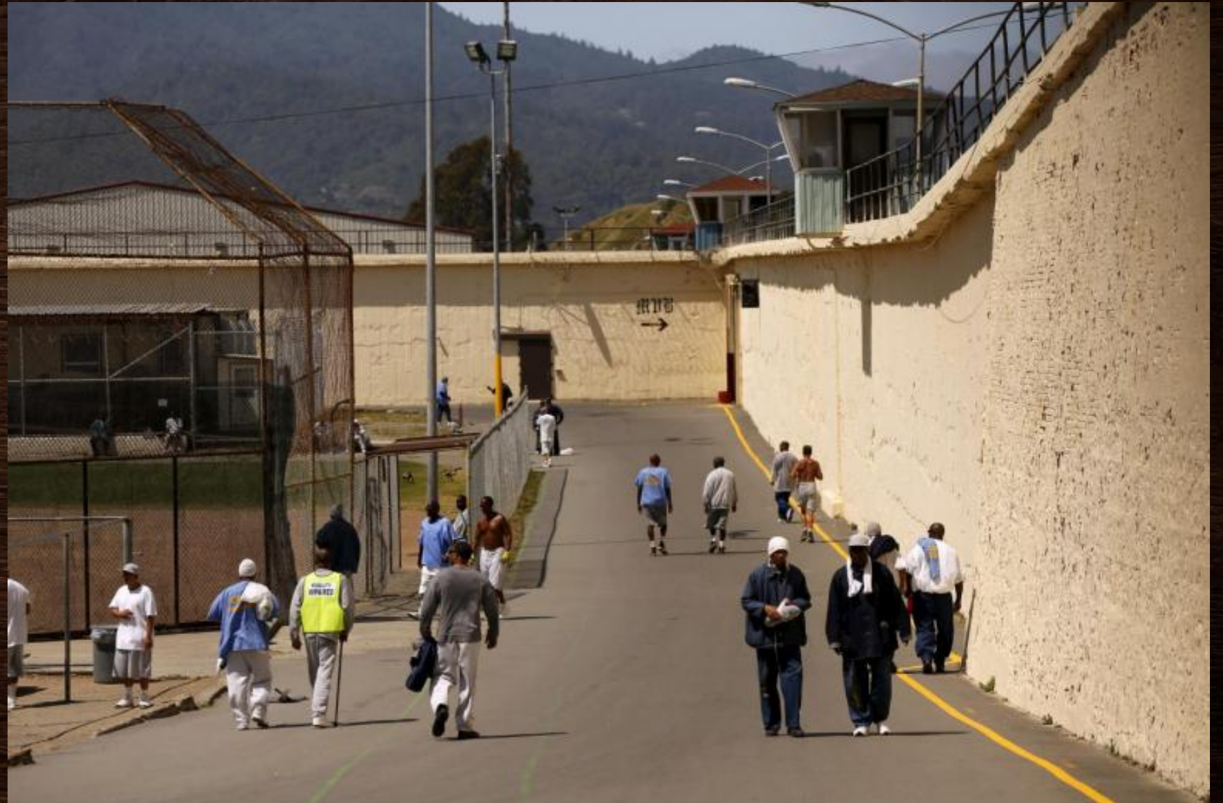
San Quentin State Prison - California