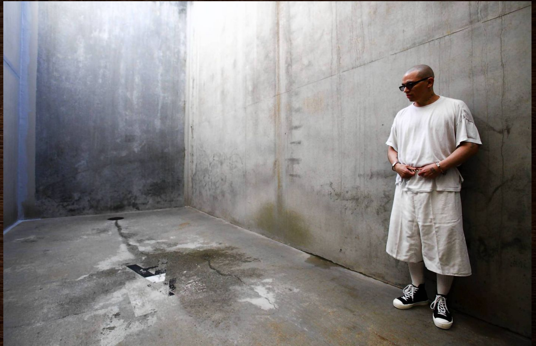
Pelican Bay State Prison - California