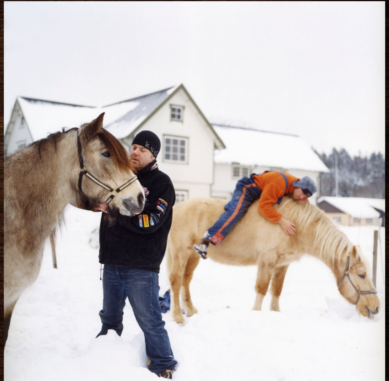
Bastøy Prison - Norway