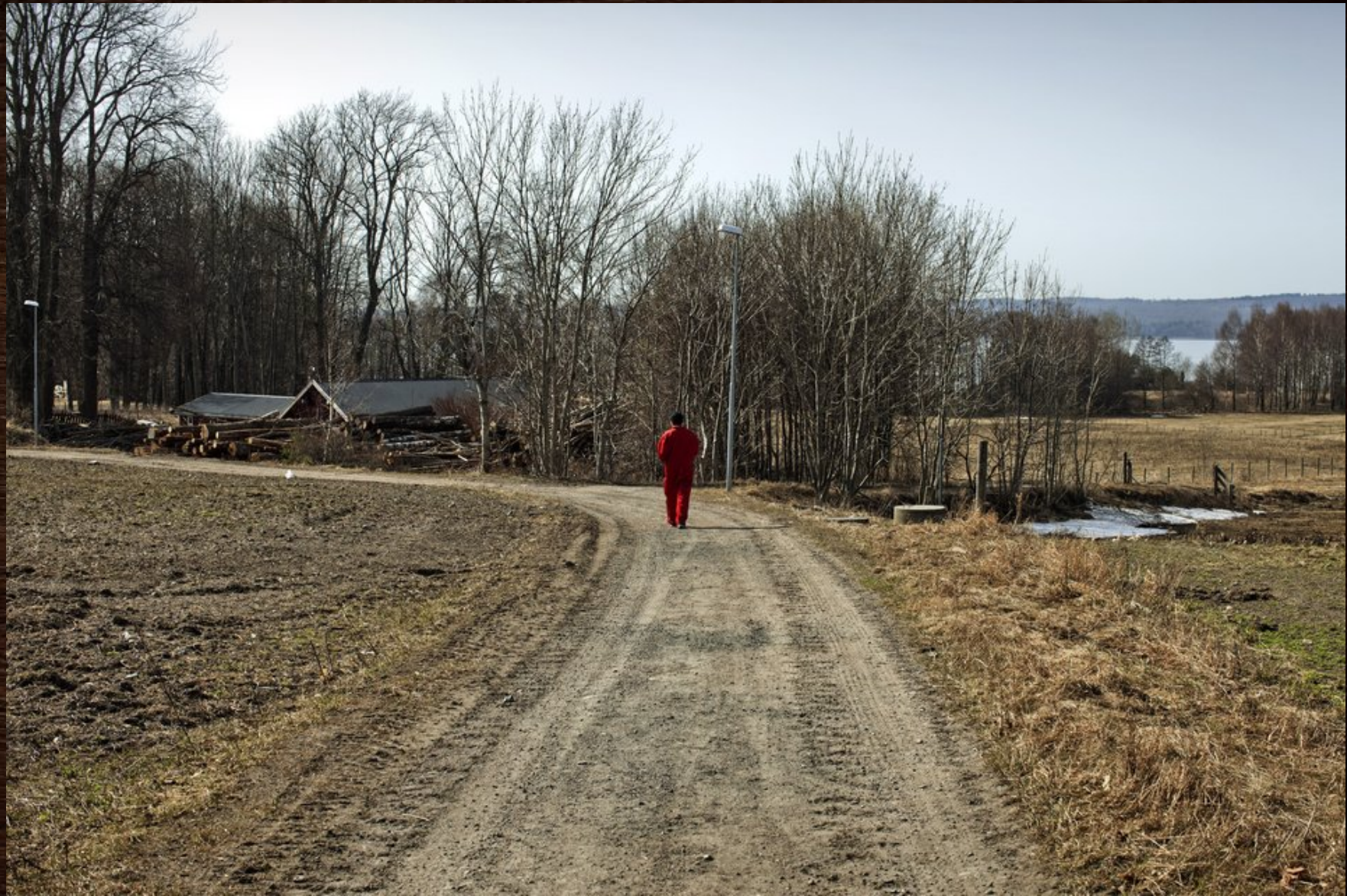
Bastøy Prison - Norway