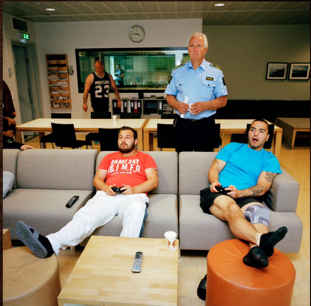
Halden Prison - Norway