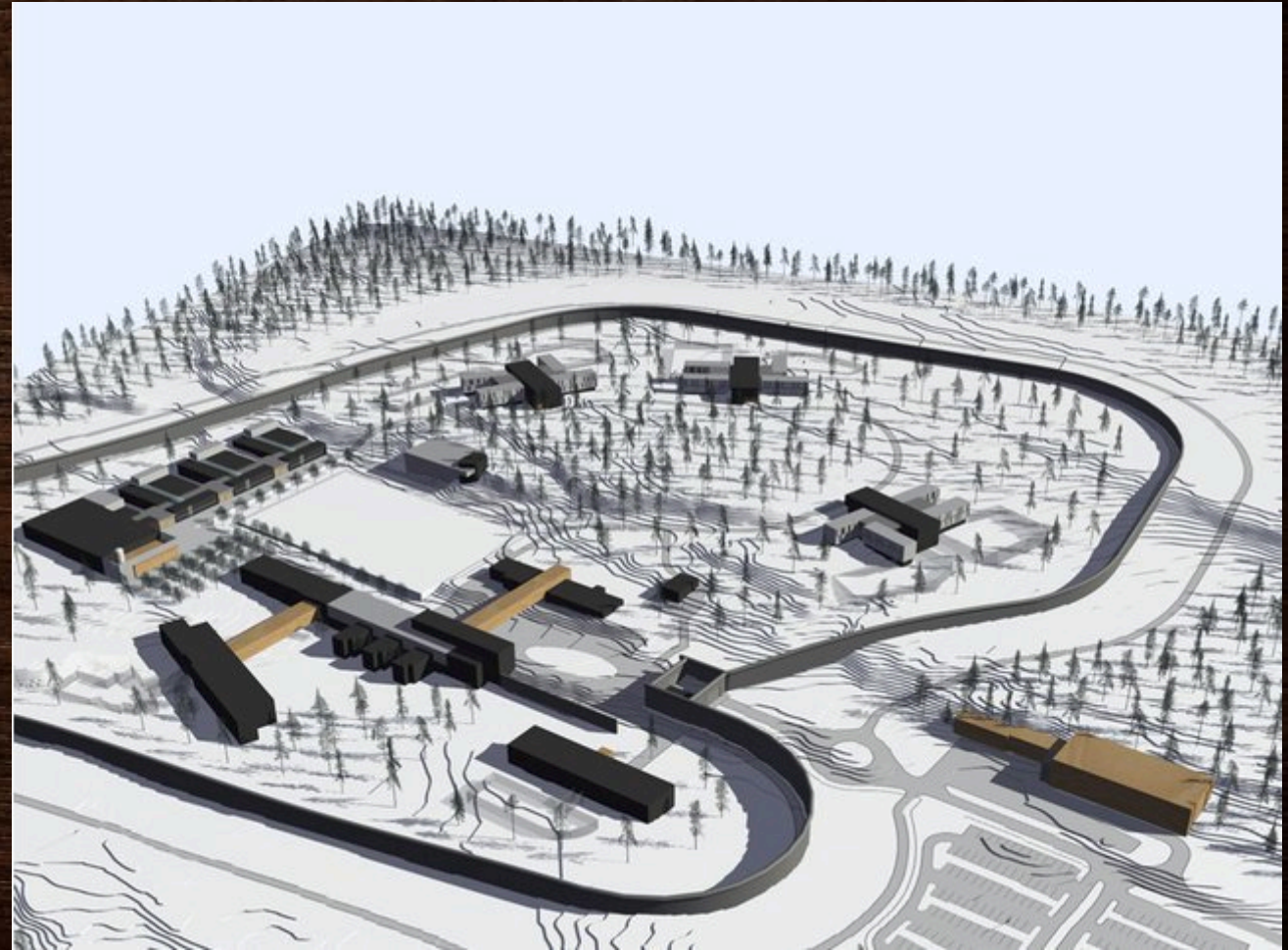
Halden Prison - Norway