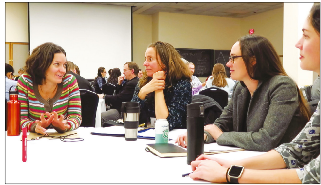
Figure 4. USGS Climate Science Center Fellows (graduate students and postdoctoral scholars) gather from across the country to discuss potential pathways for communicating and integrating their science into socially acceptable management solutions through distillation and translation.

Educational initiatives to meet emerging needs in practice-based training span a range of activities. For instance, many ecologists have called for increasing practical training through professional master's degrees (Colwell 2009; Musante 2009; Lynch 2012). The majority of formal programs that integrate ecological training into broad interdisciplinary graduate training consist of non-thesis master's degree programs, of which there are an increasing number each year (Table 3). Many of these programs have goals that overlap with those of TE; perhaps most prominently is