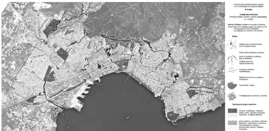
Figure 1. Thessaloniki's landscape Strategic and Operational Plan

We intend to highlight the importance and the value of physical space's continuity in both urban landscape planning and design for the development or even often for the restoration of the urban environment. We support the socio-ecological and perceptual approach in landscape architecture, claiming that it can be applied to multiple design scales in landscape architectural projects. In order to demonstrate this, we utilise the project for Thessaloniki's landscape Strategic and Operational Plan (Ananiadou-Tzimopoulou et al., 2006), and then we present our urban landscape design project for the redevelopment of Agias Sofia's axis, transformed into a strong natural and cultural urban corridor for the city.