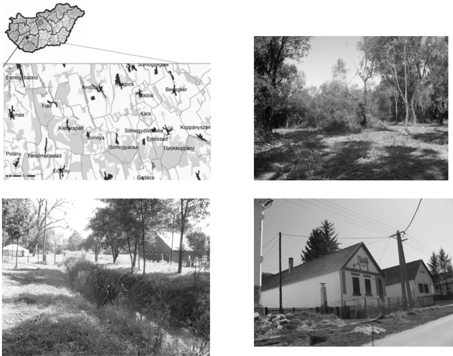
Figure 1. The pilot region; a, Situation of Koppány-valley in Hungary, b, Wilderness along the creek, c, Creek Koppány in Törökkoppány, d, Architectural values of Törökkoppány

We carried out a complex analysis revealing the natural, social and economic characteristics of Koppány-valley consisting 10 settlements focusing on three pilot areas along the creek: Törökkoppány, Karád, Somogyacsa.