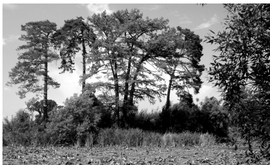
Figure 4. Coniferous group (Pinus sylvestris and Taxodium distichum) in the landscape garden in Abafája/Apalina

7. Due to the large number of significant exotic woody plants, frequently planted in mass, some of the surveyed castle gardens (Abafája/Apalina, Gernyeszeg/Gornesti, Görgényszentimre/Gurghiu, Sáromberke/Dumbravioara) present dendrological garden characteristics, having remotely striking appearances. By the means of their visual connections still present, they enrich the landscape of the Maros river valley, appearing as spots or characteristic elements and represent a serious value to landscape aesthetics. (Figure 4)