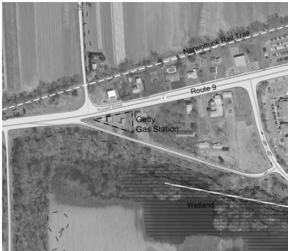
Figure 1. Site Located between the Norwottuck Trail and Connecticut River Wetland