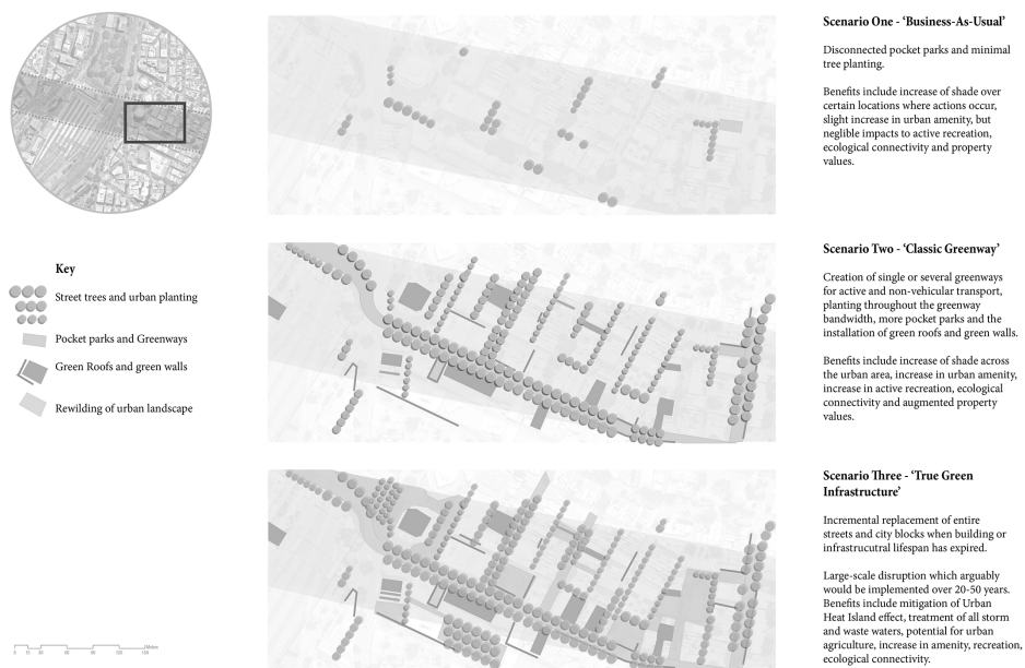
Figure 3. Three design scenarios explored across detailed study area