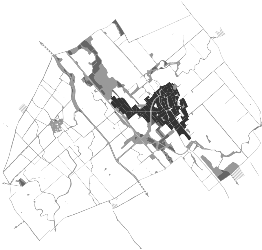
Figure 2. Prospective plan on green infrastructure connectivity and spatial integrity improvement. Pale-grey areas represent existing green infrastructure, dark-grey areas represent prospective linkages between existing discontinuous green infrastructure elements (Tóth, 2015)