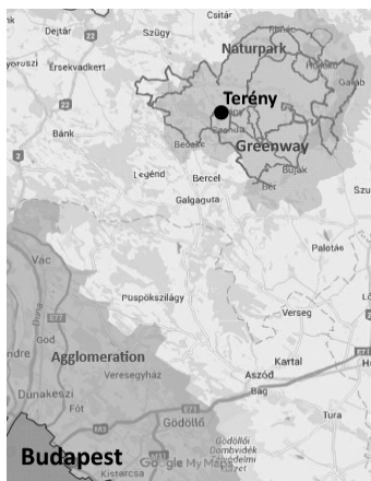
Figure 2. Cserhát greenway (on the basis of map from http://zoldut.cserhatnaturpark.hu/terkep.php )

The data from the chosen region show clearly the processes of urbanization and agglomeration. The Budapest agglomeration includes 81 settlements, which are included in the Landuse Framework Plan for the Budapest agglomeration first approved in 2005 then modified in 2011 (terport.hu).